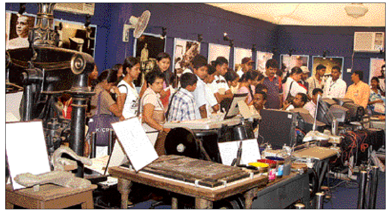
As the sun amd moon rise so will the Lake House: The Lake House stall displayed a variety of printing machines that gave a glimpse of how it was done in the past