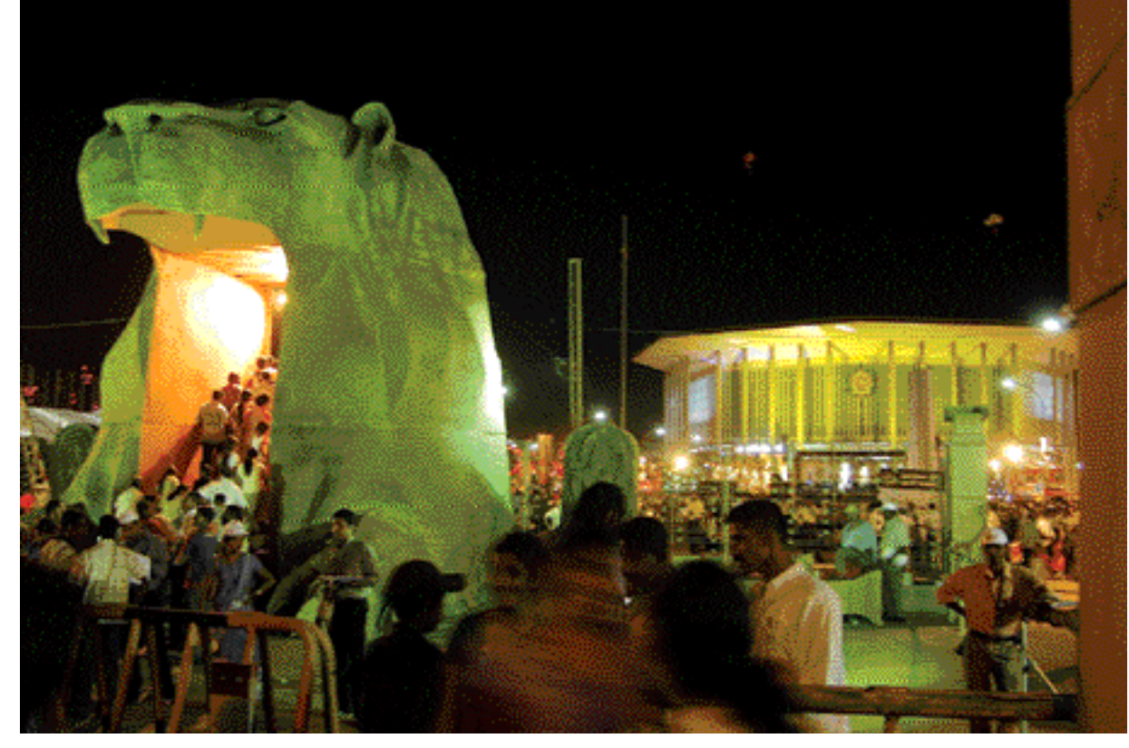
Enter the Lion: Thousands of people flocked at the entrance