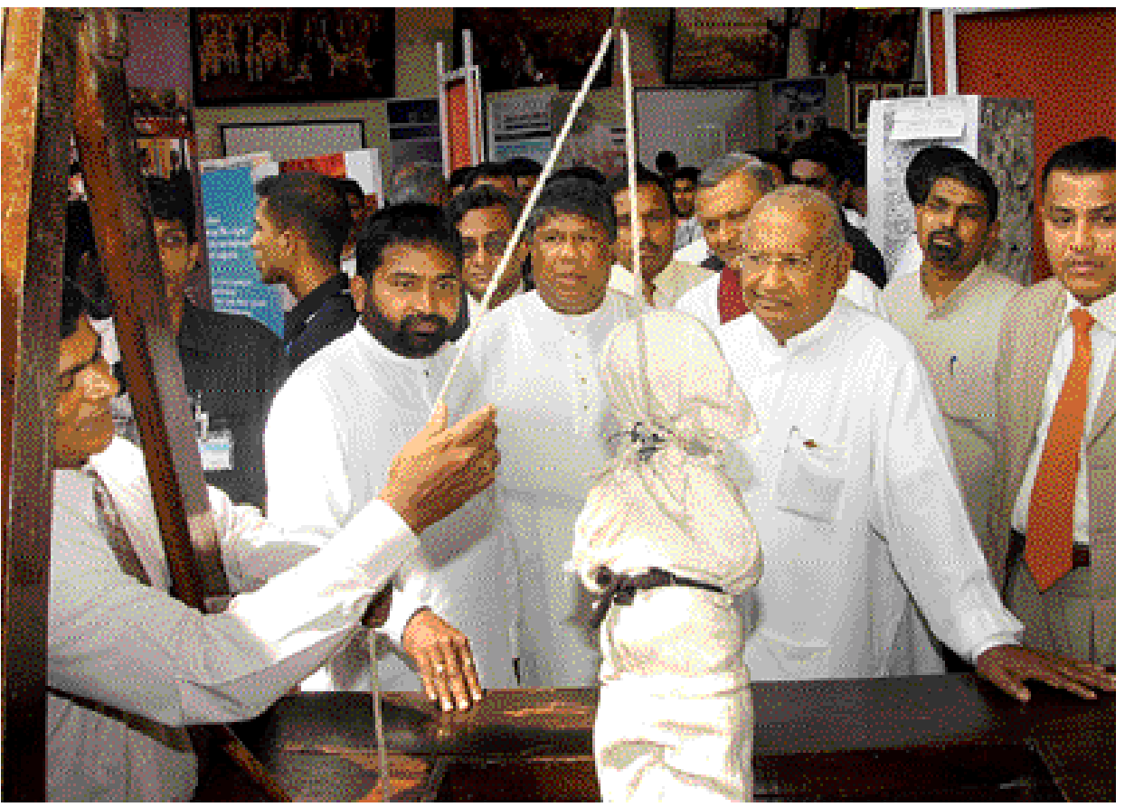
Checking the noose: Prime MinisterRatnasiri Wickramanayaka at a stall that displays the gallows