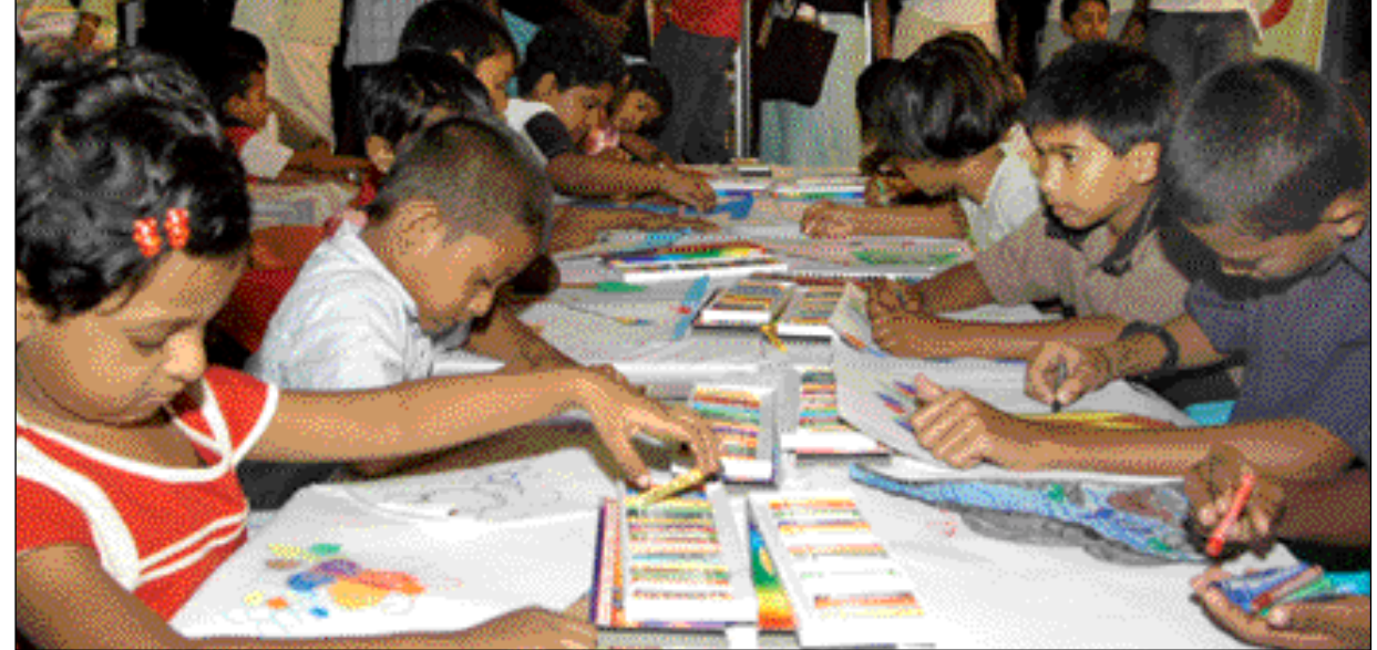
Sweet pictures: Children participating at the Mihira Childrens' Art competition at the Exhibition