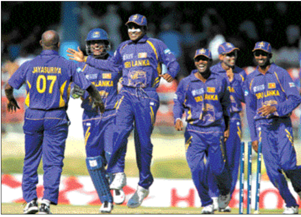
Sri Lankan cricket captain Mahela Jayawardene (3rd L) congratulates bowler Sanath Jayasuriya (L) after the dismissal of Indian batsman Yuvraj Singh (unseen) at the Queen's Park Oval in Port-of-Spain, Trinidad and Tobago, 23 March 2007, in the Group Stage of the ICC Cricket World Cup 2007.