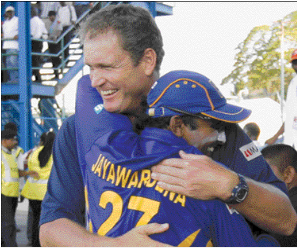
Sri Lanka's coach Tom Moody congratulates his team captain Mahela Jayawardene for their victory over India during the World Cup cricket match in Port of Spain March 23, 2007.

In pensive mood... India Cricket Captain Rahul Dravid gestures during the man of the match ceremony after losing their match to Sri Lanka at the Queen's Park Oval in Port of Spain, in Trinidad and Tobago, 23 March 2007, in the Group Stage of the ICC Cricket World Cup 2007. Sri Lanka stormed into the World Cup Super Eights after virtually knocking India out of the tournament with an emphatic 69-run win.