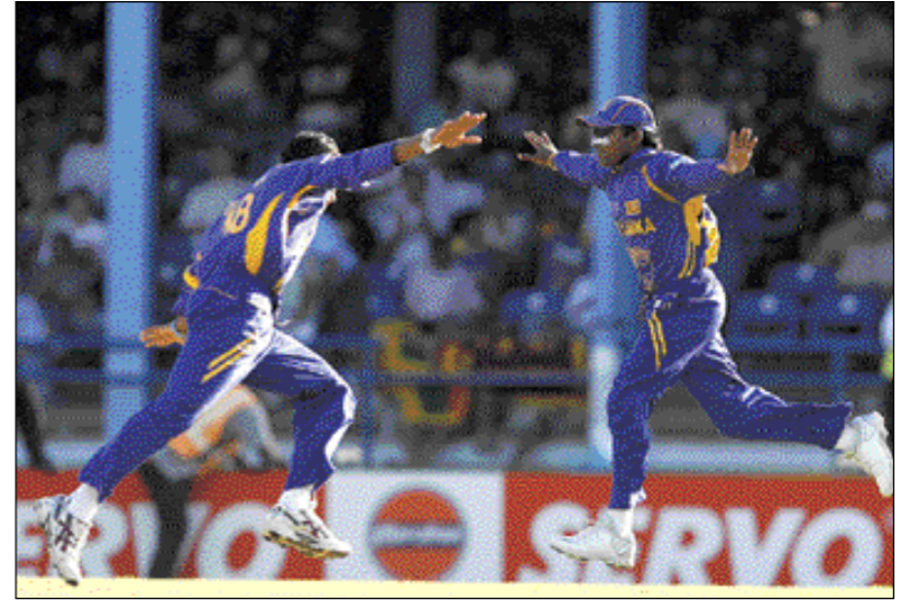
Sri Lankan cricket captain Mahela Jayawardene (R) celebrates victory over India at the Queen's Park Oval in Port-of-Spain, Trinidad and Tobago, 23 March 2007, in the Group Stage of the ICC Cricket World Cup 2007. Sri Lanka made 254 and India scored 185.