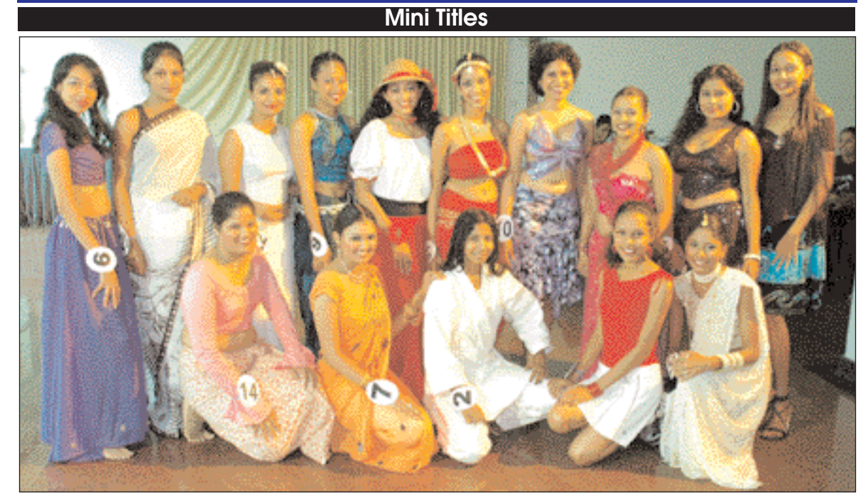
'Ms. Talent' contestants

'Ms. Talent' and 'Ms. Catwalk' mini titles of 'Ms. Lanka 2007' was held recently. Fifteen contestants took part in the mini pageant. A diverse talent search with many performances of Indian dance modes to Hindi music and a few oriental dances to local songs were presented. Singing was also part of the entertainment, and one contestant even performed skills in Karate. It was quite a colourful afternoon with a lot of entertainment - dancing and music.