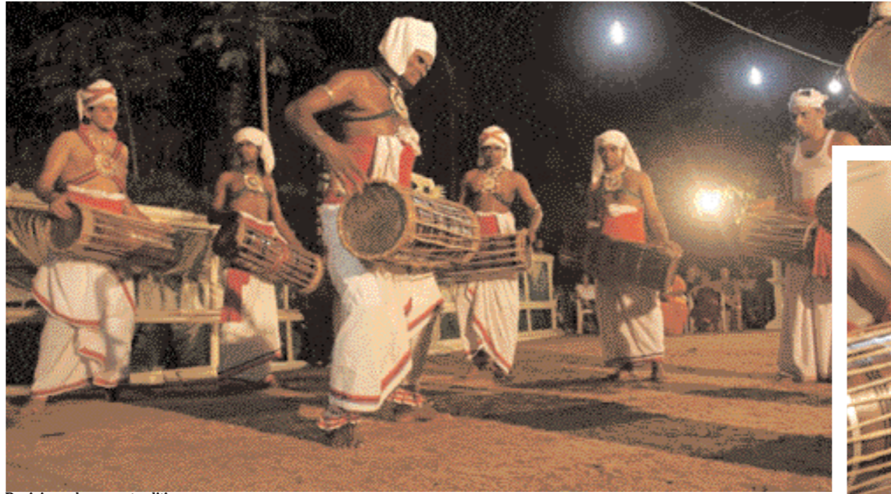
Reviving a by-gone tradition