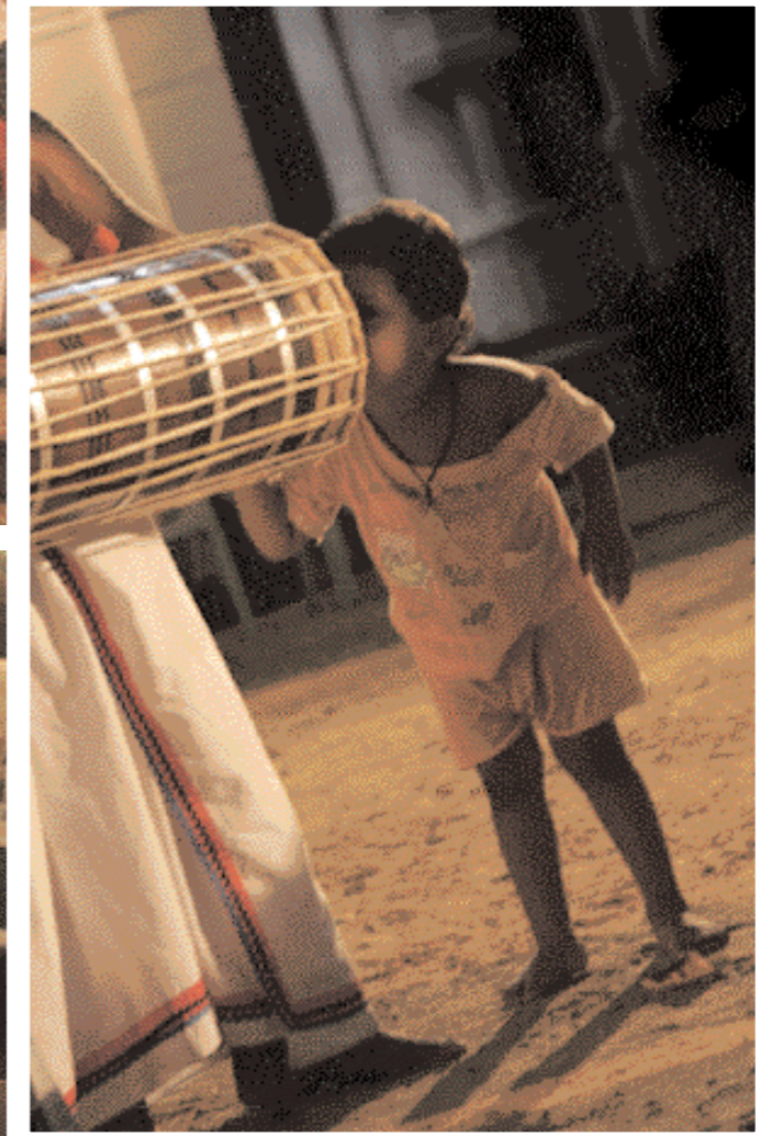
A kiss from the future