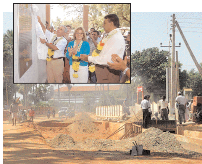
Moving towards the future