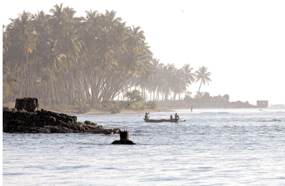
At six in the morning