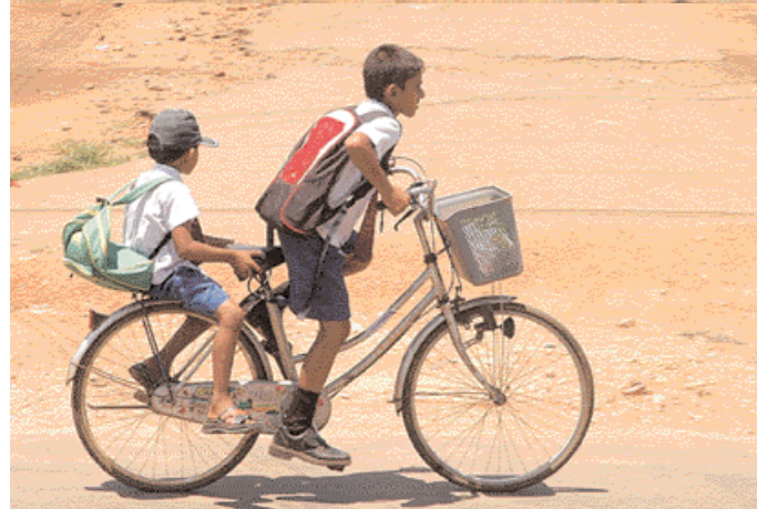
Back to school