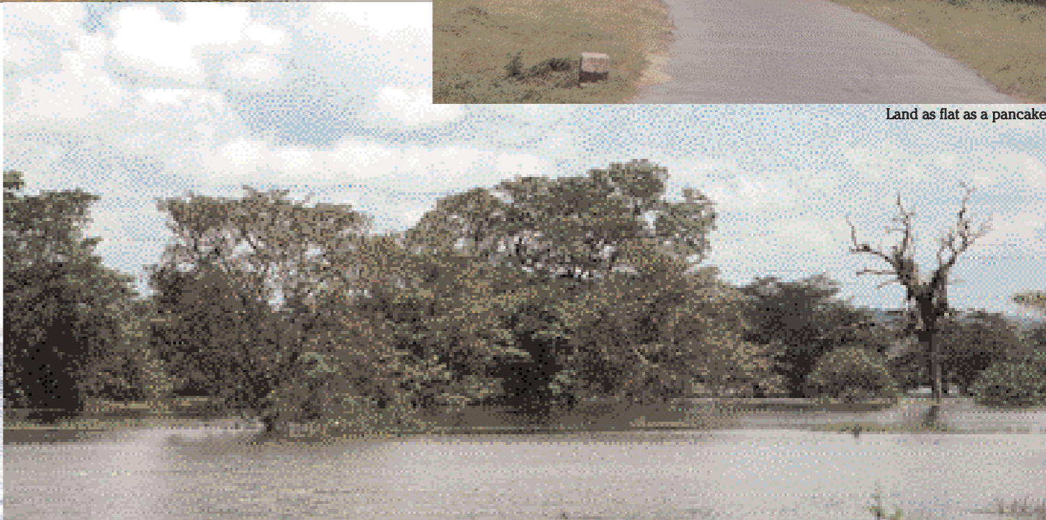
At ten in the morning