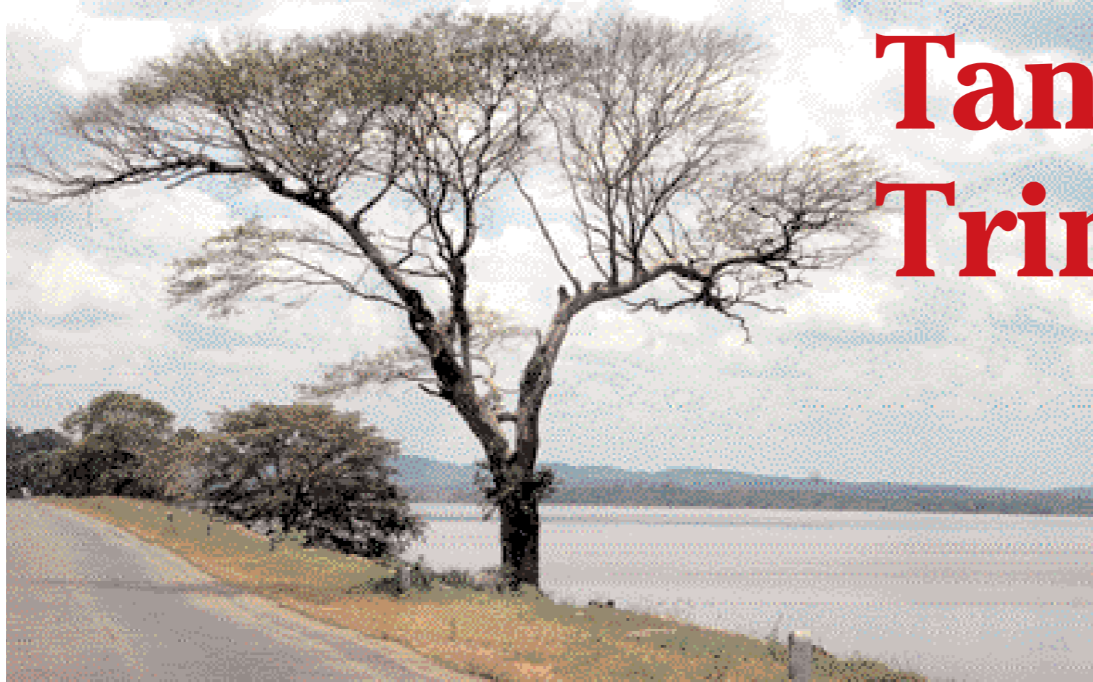
A memorable journey