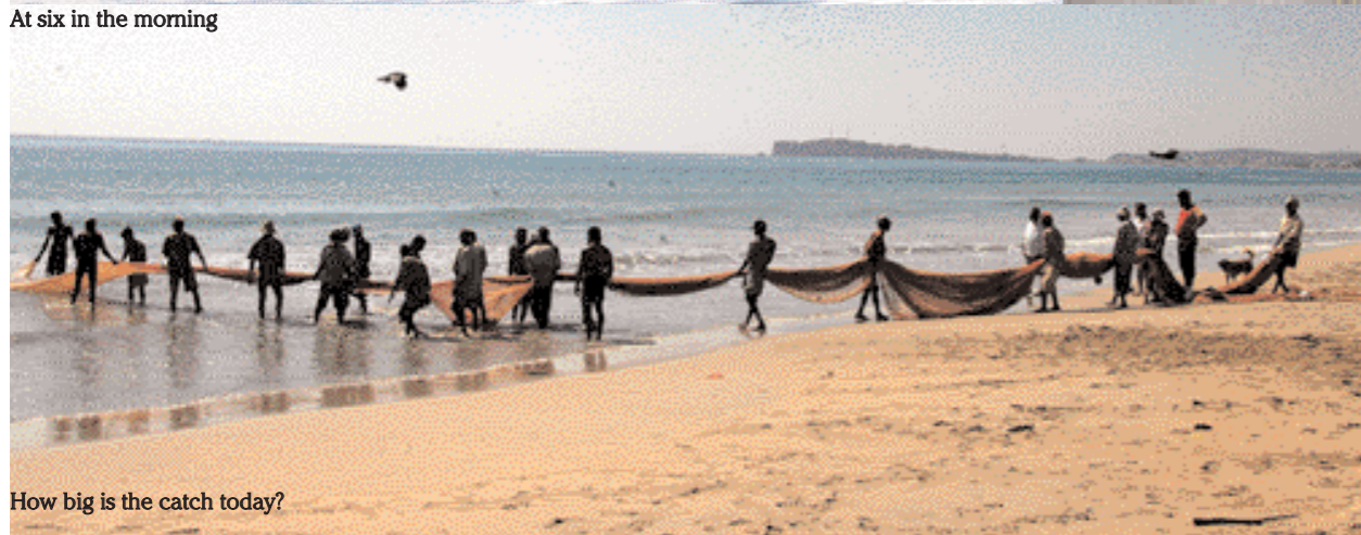
How big is the catch today?