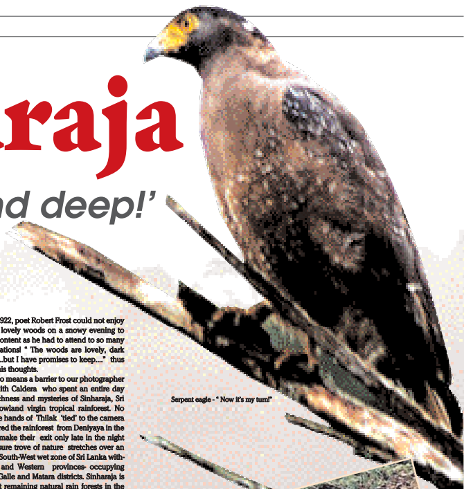
Serpent eagle - "Now it's my turn"