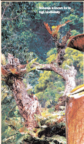
Sinharaja is known for its high biodiversity