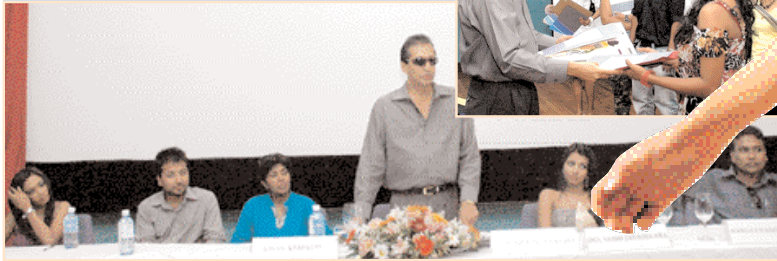
The panel of judges with the Chairperson announcing the fifteen finalists.