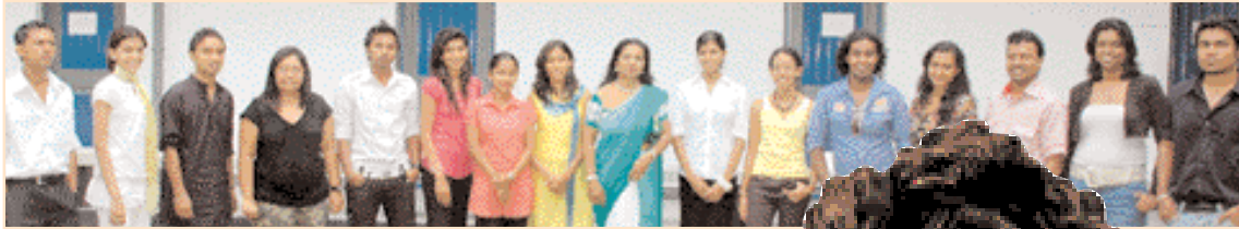
The fifteen finalists