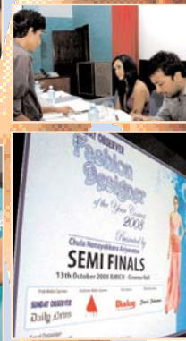
Some of the designer wear sketches presented at the semi finals.