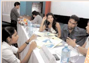
Contestants presenting their work before the panel of judges

Dialog GSM have come forward as the Gold Sponsor. M/S Aitken Spence together with many other sponsors have pledged to make this a memorable night for all you finalist. And as you get ready with your creations we wish you good luck. Keep in mind that Adornment is never anything except a reflection of the heart.