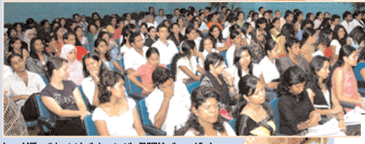
Around 125 participants take their seats at the BMICH for the semi finals