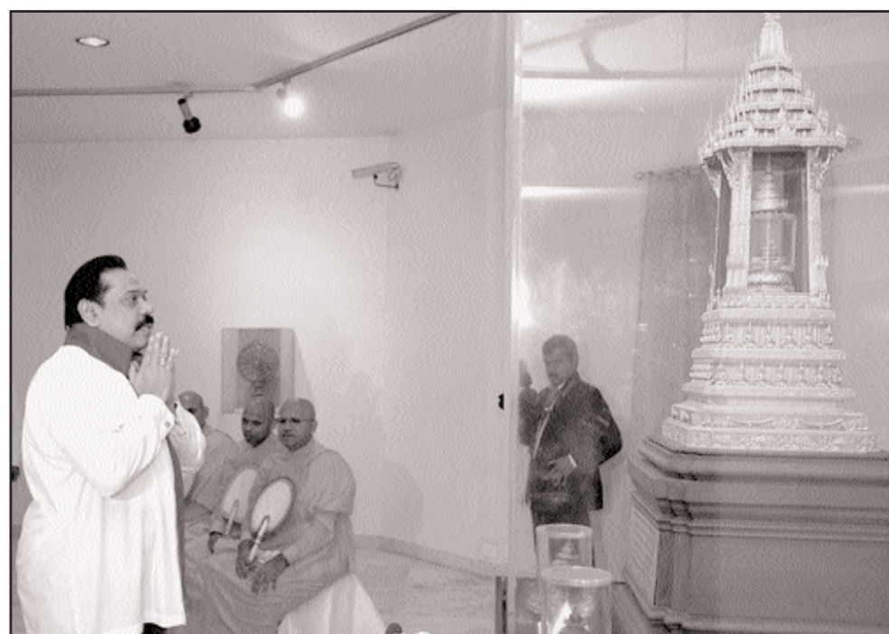
President Mahinda Rajapaksa pays homage to the Sacred Relics of the Buddha from Kapilawastu on his visit to the Buddha Gallery at the New Delhi National Museum.