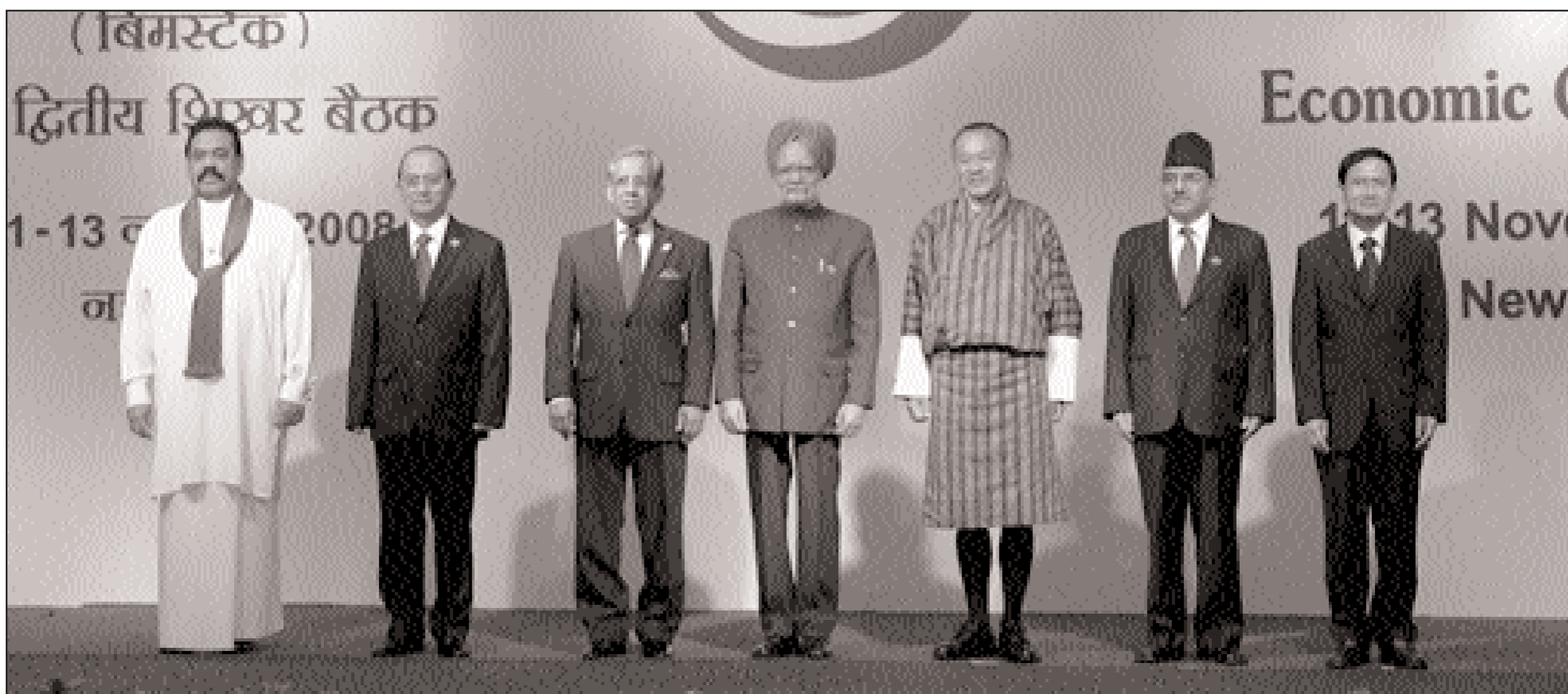
Leaders of the BIMSTEC countries pose for a group photo prior to the inauguration of the Second BIMSTEC Summit at the Taj Palace Hotel in New Delhi. From left: President Mahinda Rajapaksa, Prime Minister of Myanmar General Thein Sein, Bangladesh Chief Advisor Fakhruddin Ahmed, Indian Prime Minister Manmohan Singh, Prime Minister of Bhutan Lyonchhen Jigmi Y. Thinley, Prime Minister of Nepal Pushpa Kamal Dahal 'Prachanda' and Prime Minister of Thailand Somchai Wangswat.