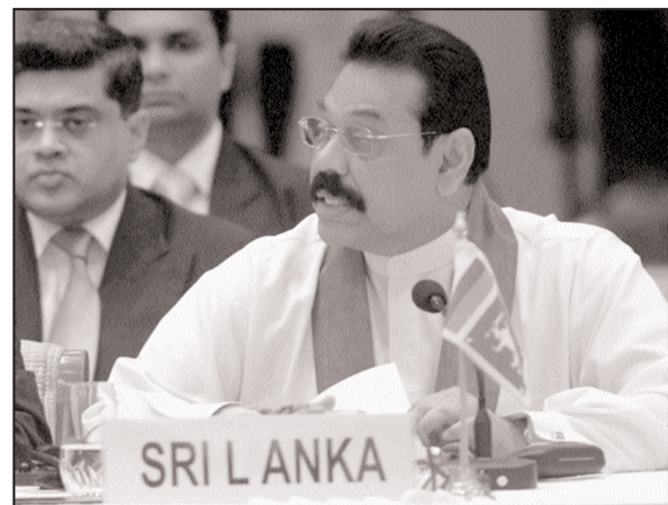
President Mahinda Rajapaksa at the BIMSTEC Summit.