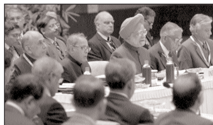
Indian Prime Minister Dr. Manmohan Singh and delegation at the BIMSTEC Summit.