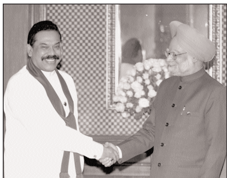
President Rajapaksa meeting Indian Prime Minister Dr. Manmohan Singh.