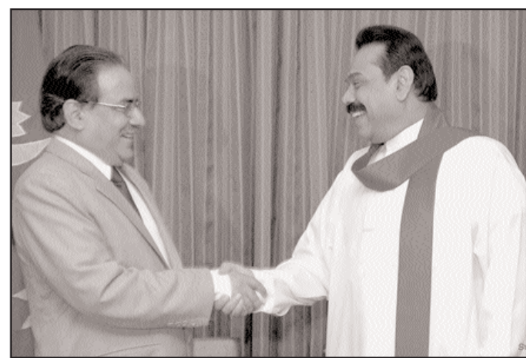
The President meeting the Prime Minister of Nepal Pushpa Kamal Dahal.