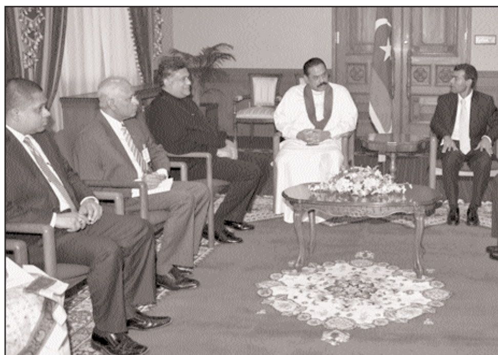
President Rajapaksa and Maldivian President Mohamed Nasheed having talks.