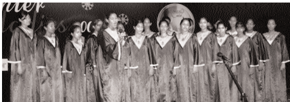
A Christmas Carol presentation by the students of St. Lawrence College, Colombo organised by the Thonuryatti Helek organisation was held at the Colombo Bishop's College auditorium, in aid of 300 street children in the Colombo city recently.