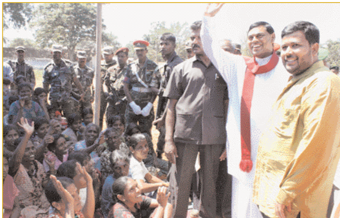
A high ranking Government delegation led by Senior Presidential Advisor Basil Rajapaksa MP visited the Menik Farm welfare centre, Chettikulam, Vavuniya for the displaced children. Disaster Relief and Resettlement Minister Rishard Bathiudeen, is also in the picture

The Government has set up three villages to resettle displaced civilians arriving from the Vanni. Kadiringamar Village set up in the former Menik Farm area is one of them.