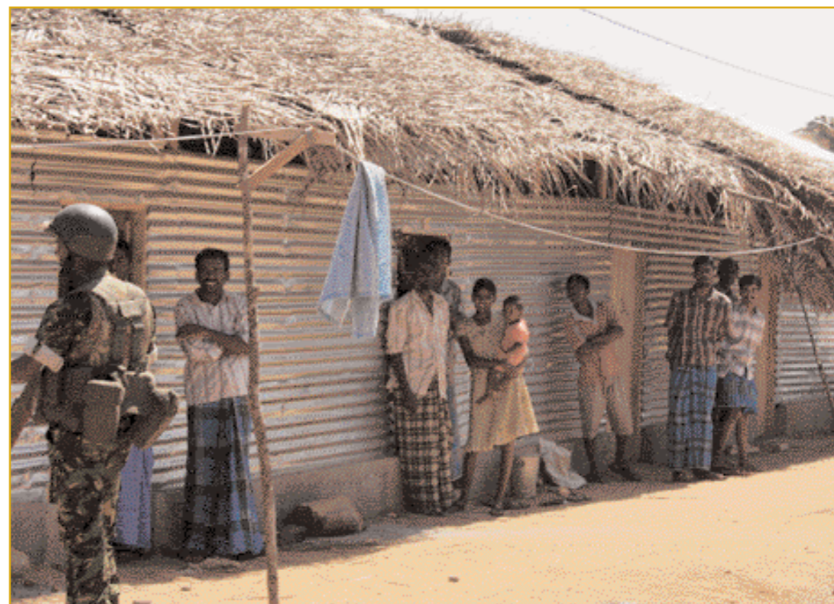
Temporary houses for the displaced