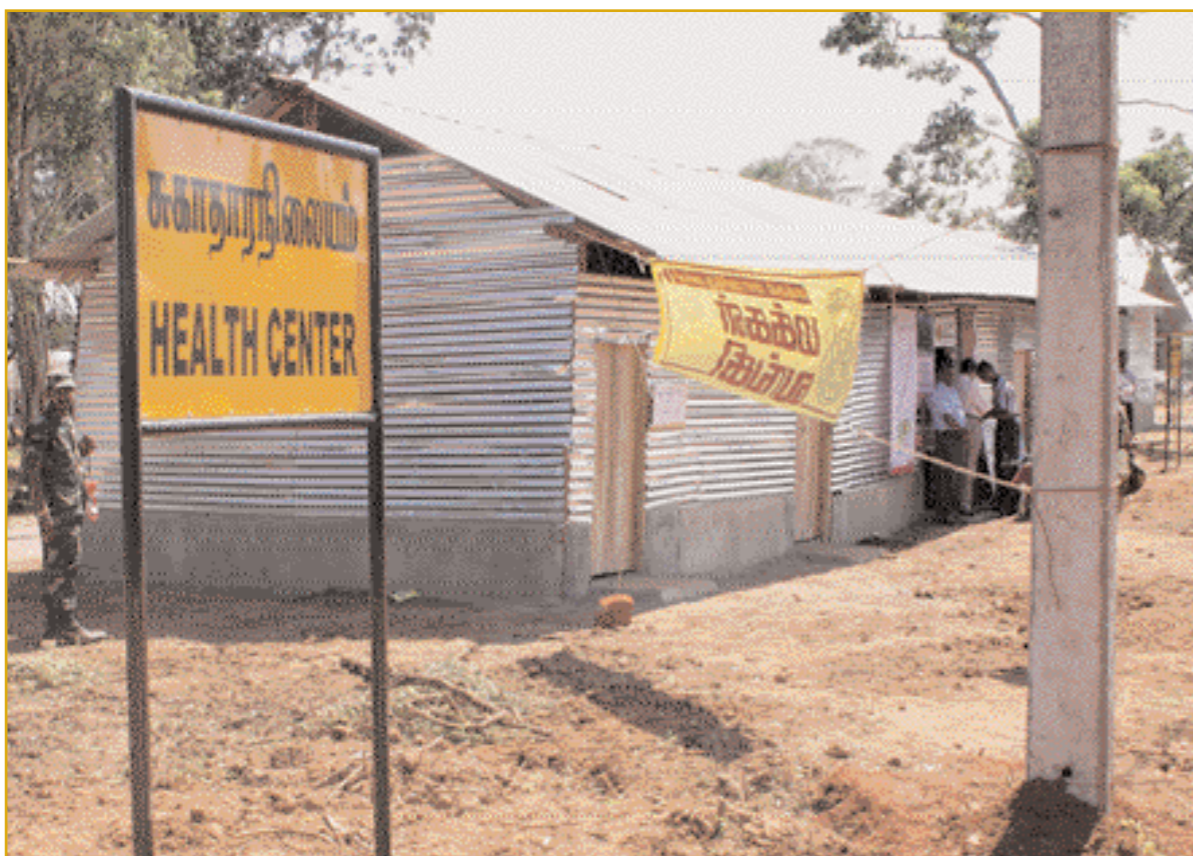
A makeshift health center