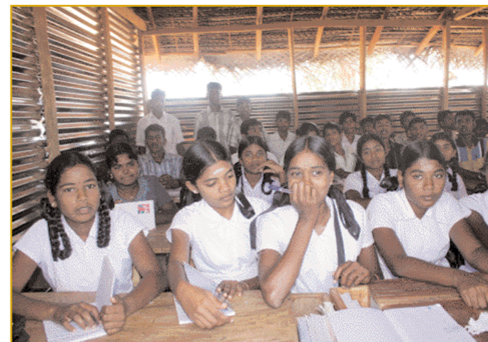
Children in their new school

A high ranking government delegation led by Senior Presidential Advisor, Basil Rajapaksa, MP visited the Kadiringamar Village and inspected the facilities provided to the villagers including the recently opened school for children of families that arrived from the Vanni.