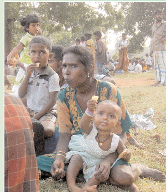
Hoping for a bright future