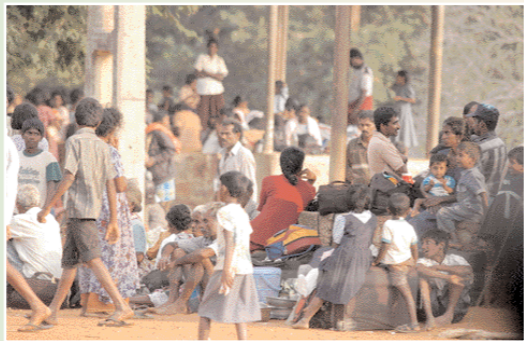
Sweet smell of freedom