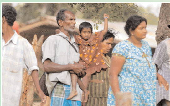
Waiting for the turn...