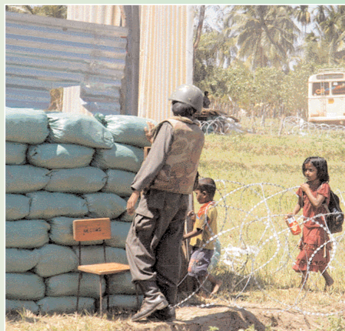
Toddlers subjected to checks, especially after the suicide bomb explosion