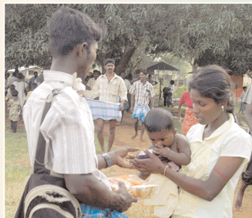
A brief moment to pet the child