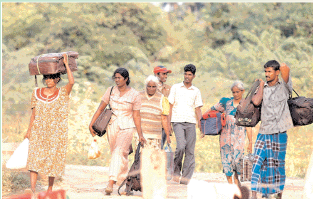
The long trek...