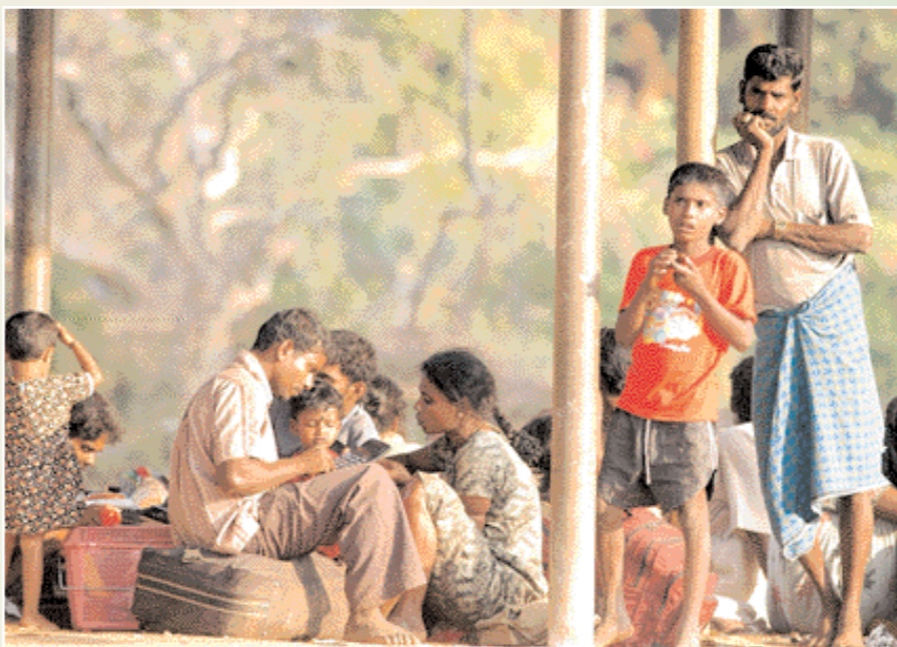
Enjoying a hearty meal after days...