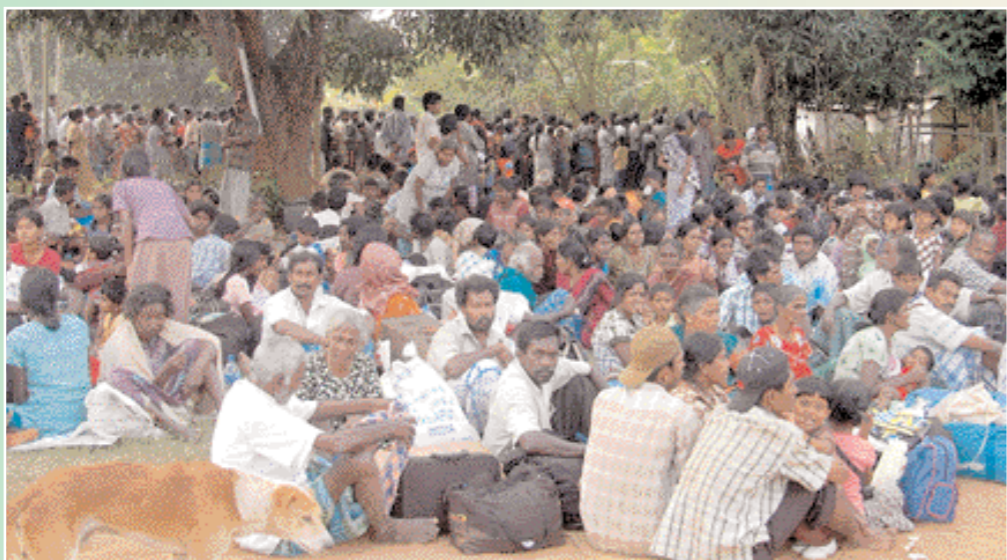
...and a rest