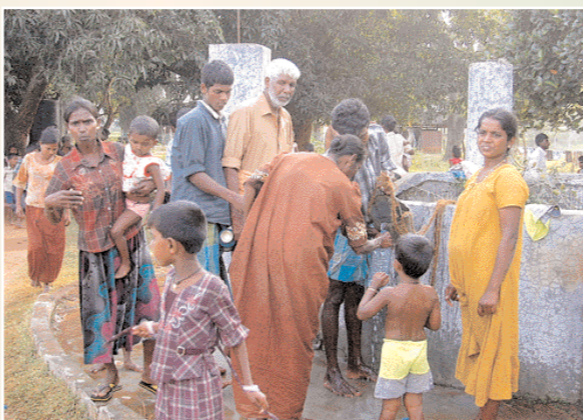
At last, access to safe drinking water