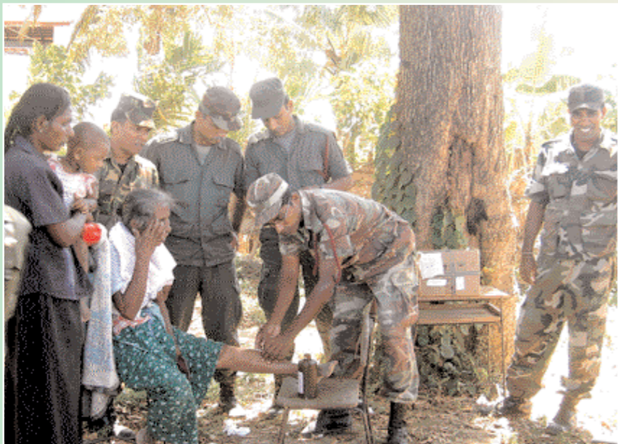
Soldiers providing first aid to an old woman