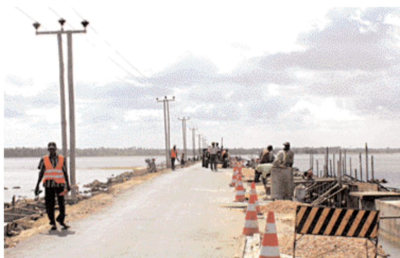
Construction of Mannar Peace Bridge is scheduled to be completed by mid next year