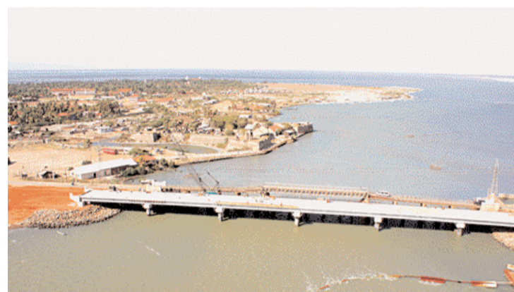
Jaffna-Karainagar highway is under construction as a part of infrastructure development in the Jaffna Peninsula