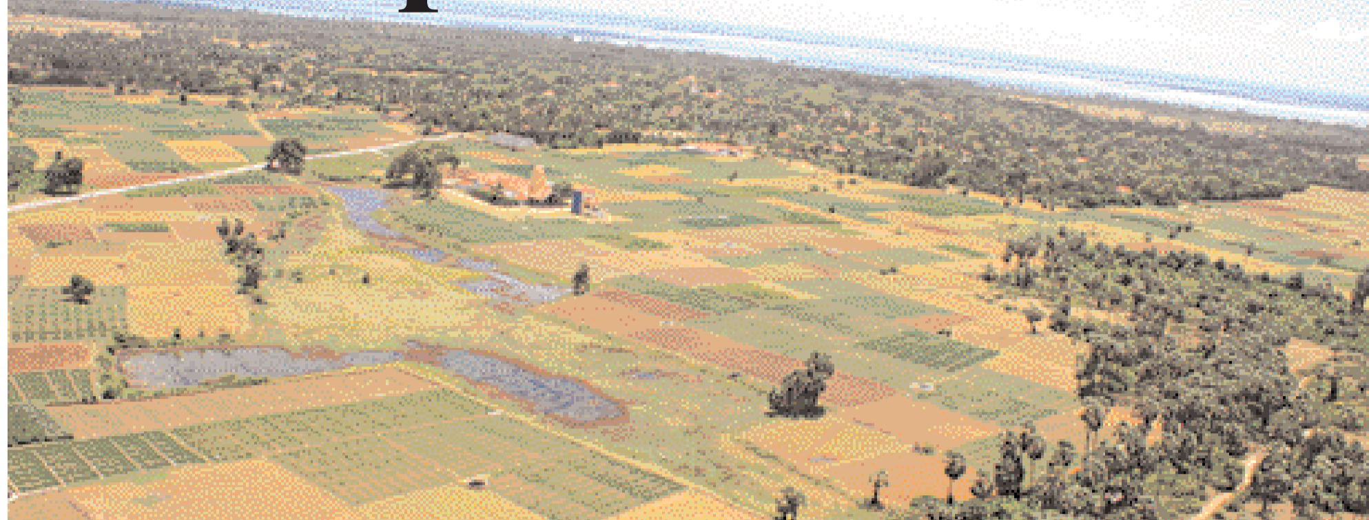
An aerial view of Jaffna cultivation as farmers have returned to their normal day-to-day life in a big way

The Government has embarked on a massive development plan in the Northern Province to improve infrastructure facilities under Uthuru Wasanthaya . Under the instructions of President Mahinda Rajapaksa, Senior Presidential Advisor Basil Rajapaksa is spearheading the mega development project, aimed at assuring a better tomorrow for the innocent civilians rescued from the jaws of LTTE terror.