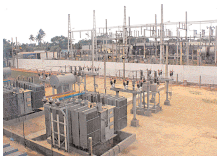
The newly constructed Chunnakam power station that is geared to provide an uninterrupted 24-hour power supply to the Peninsula