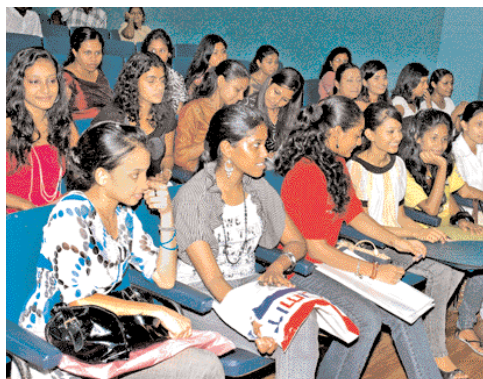
A section of the participants