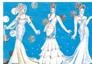
Some of the eye-catching design sketches presented by contestants