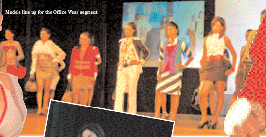
Models line up for the Office Wear segment