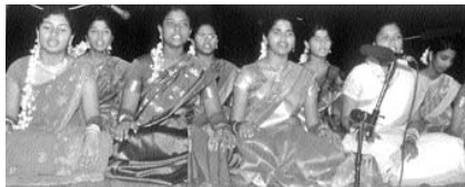
The annual concert of Ramanathan Hindu Ladies College, Bambalapitiya, Colombo 4 was held at the Kathartha Hall, Bambalapitiya recently. Here a group of students present a cultural musical program.