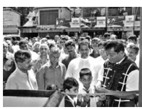
Livestock Development Minister, C. B. Ranayake opens the new bus stand at Padiyapalala. Central Provincial Councillor, S. P. Ranayake is also in the picture.