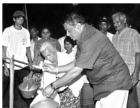
The Thankitiyawa drinking water supply scheme in the Walapana Divisional Secretariat Division, constructed under the "Gama Neguma" concept was commissioned by the Livestock Development Minister, C. B. Ranayake recently. Over one hundred and fifty families in the area will benefit by the scheme.