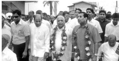
Ministers Felis Perera and Dr. Rajitha Senarathne being conducted to the venue of the foundation stone laying of Nangooram Pola at the Maradana Fisheries harbour area, Beruwala recently.