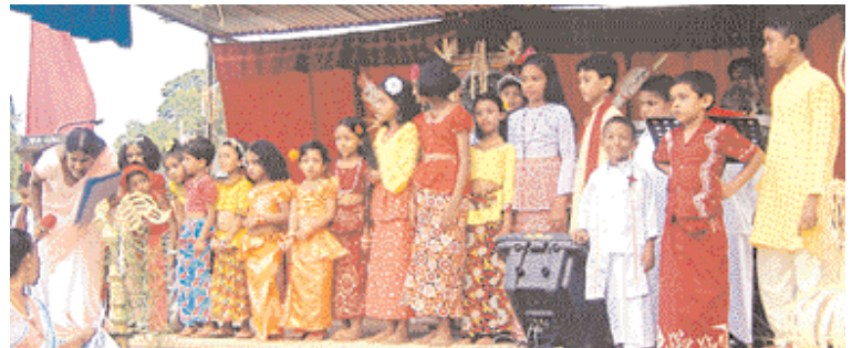
Children participating in an event at the Annual Sinhala and Hindu New Year festival held at Uyanwattha playground, organised by the Matara Police Station.