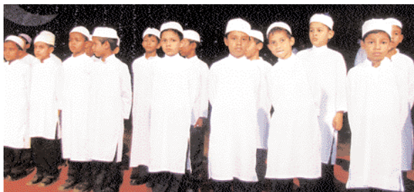
An Islamic religious ceremony was held at the Navaranghala Hall recently to mark the 175th anniversary celebrations of Royal College, Colombo. Here the students of Grades 3,4 and 5 are reciting Qaseedha.