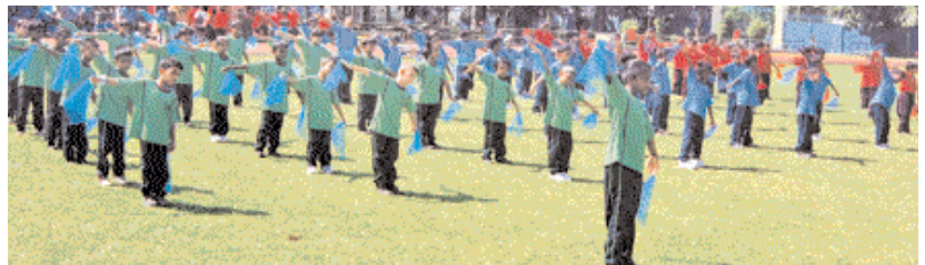
The students of Grades 1,2 and 3 presenting a drill display at the annual Inter House Sports Meet of Learnium International School, Rajagiriya, held at the Sugathadasa Stadium, Colombo recently.