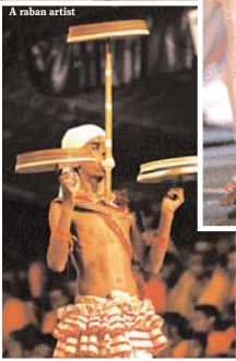
A ravan artist