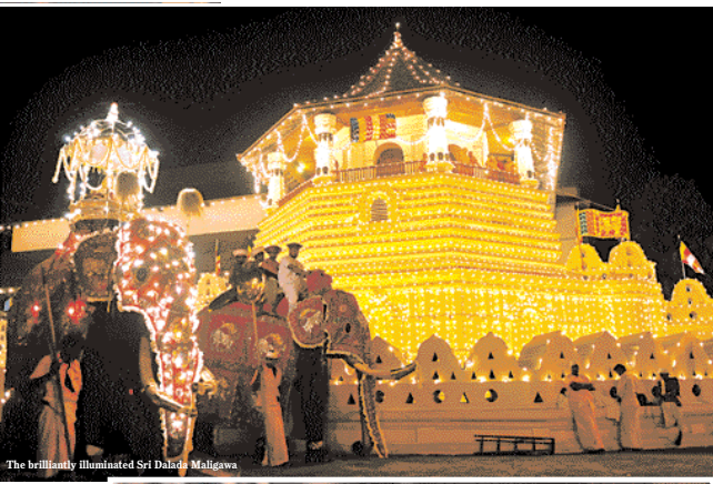
The brilliantly illuminated Sri Dalada Maligawa