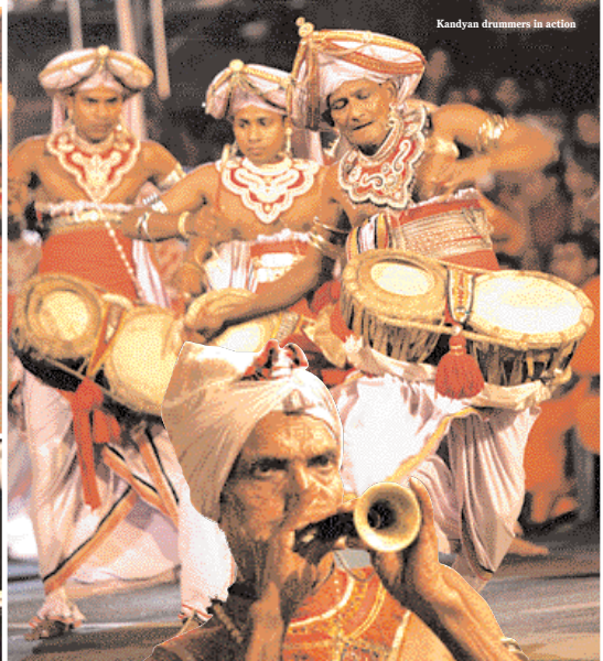
Kandyan drummers in action