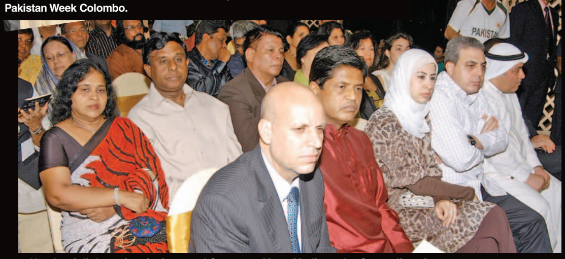
Heads of diplomatic missions and Secretary Mass Media at the Qawwali performance.