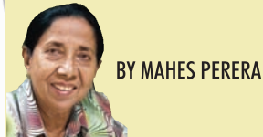
BY MAHES PERERA

Just imagine your fashion creations snapped up by the international market! It may have figured in your dreams but it could be a reality if you are the lucky winner of the Asian Fashion Designer 2011. What's more the possibility of you being employed by a fashion industry or getting the opportunity to train abroad to learn the finer points in fashion designing is yours for the asking. Sounds exciting don't you think? So