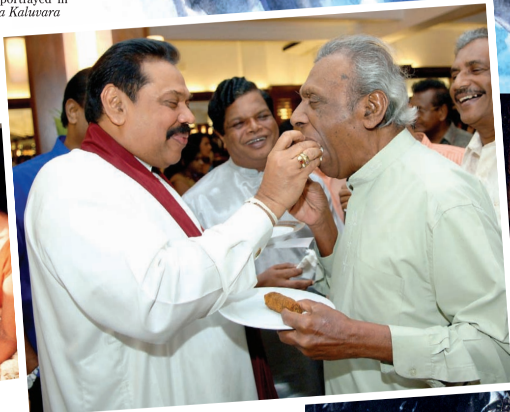
A moment with President