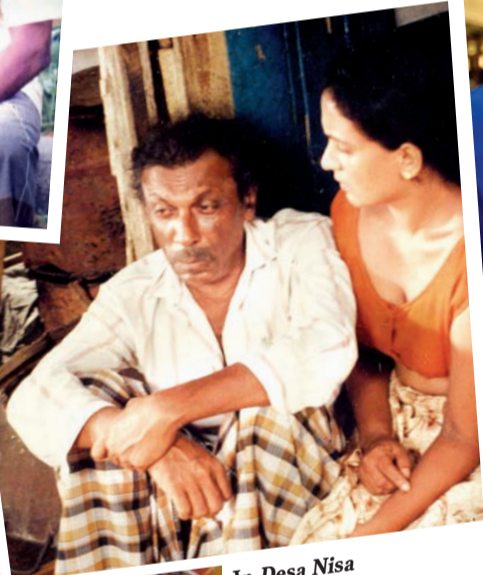
In Desa Nisa