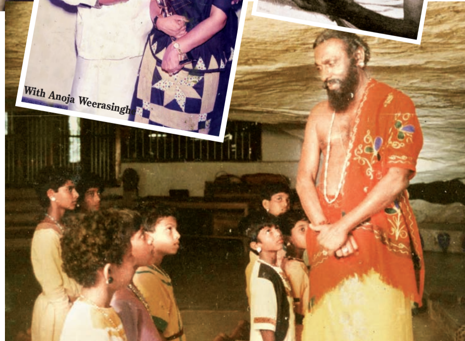
Diverse roles he played in his early days in cinema