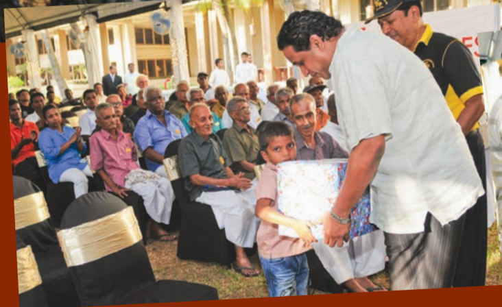
Gifts for children