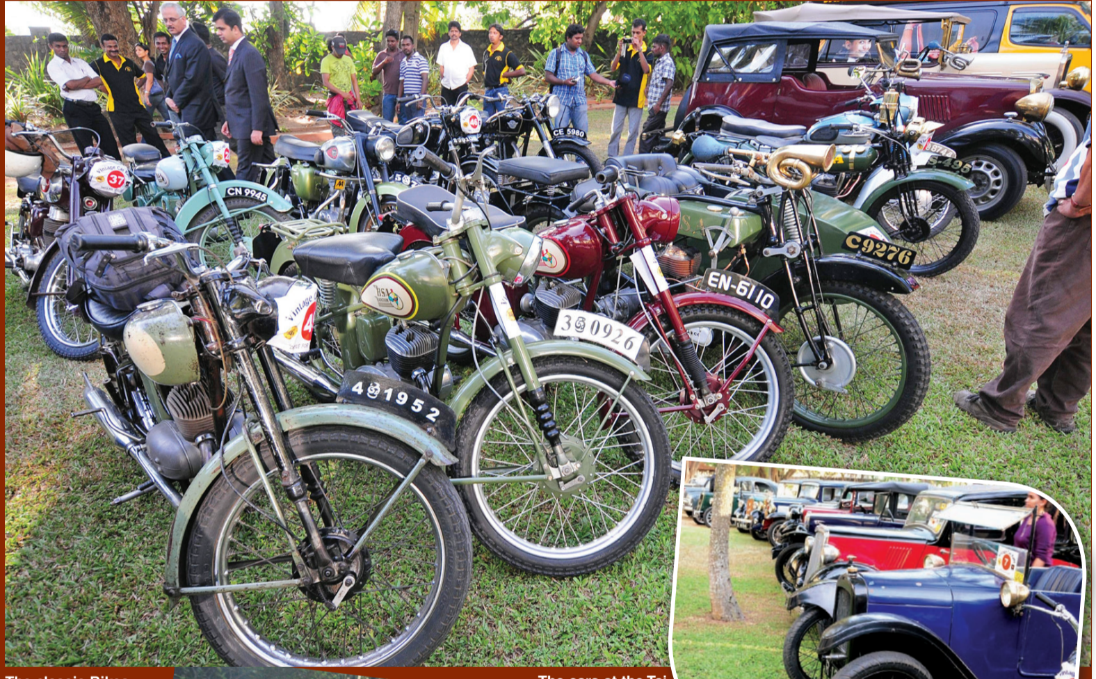
The classic Bikes