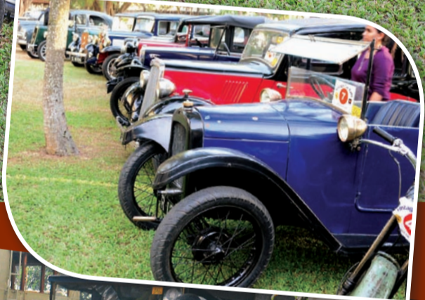
The cars at the Taj