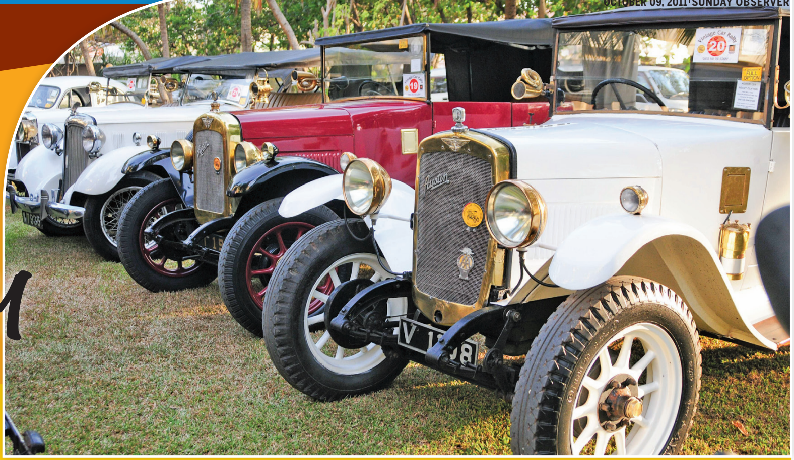
The vintages at the Taj

October 1 is dedicated internationally as the "World's Elders and Children's Day"