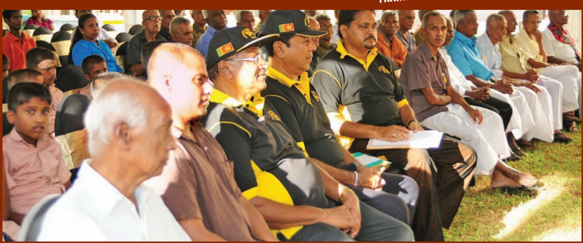
At the Taj