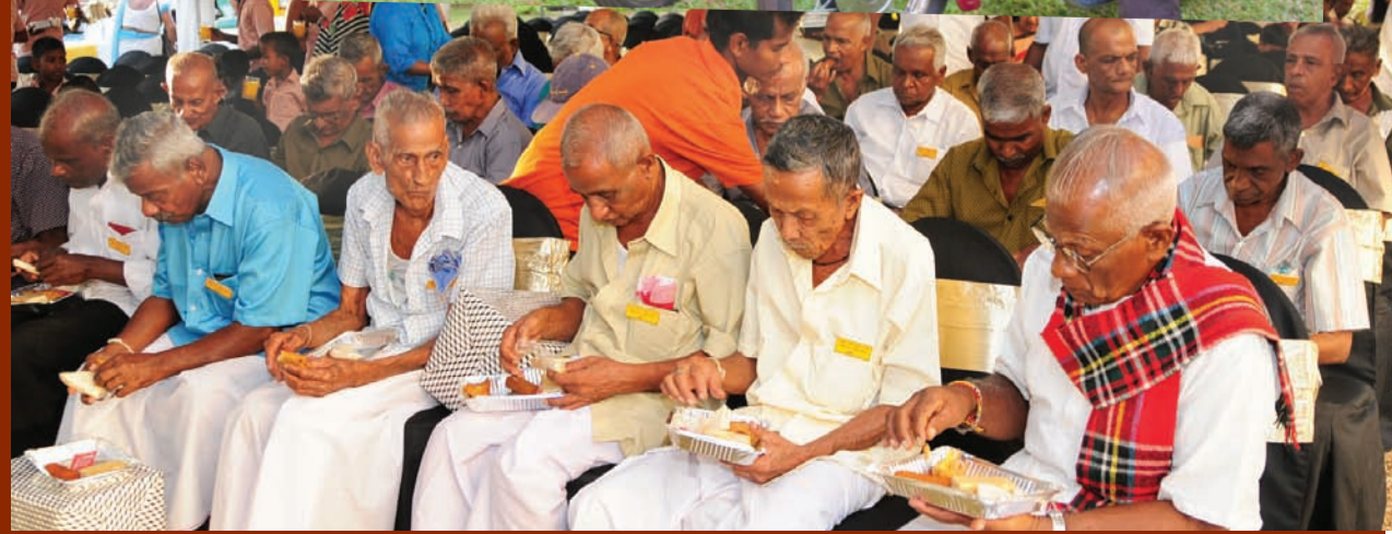
The elders enjoying tea at the Taj