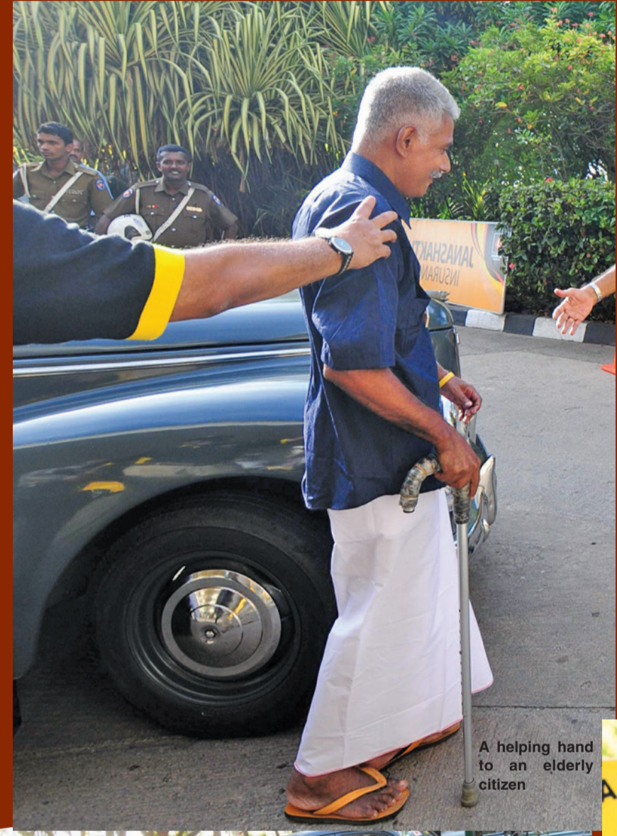
A helping hand to an elderly citizen