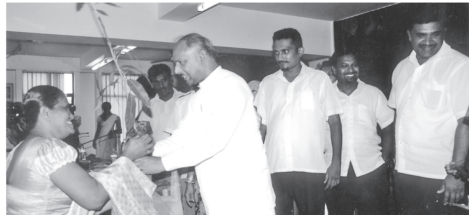
Water Supply and Drainage Minister Dinesh Gunawardane distributed forest plants and home garden appliances worth Rs. 200,000 to 157 households in the Maharagama electorate recently at a ceremony at the Maharagama Divisional Secretariat. Here the minister presents a mango sapling to a recipient.