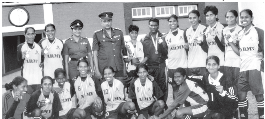
The Inter-Club Women's Football tournament organised by the Sri Lanka Football Federation was held at the Police grounds, Bambalapitiya recently. Sri Lanka Army Women's Football Club clinched the championship. Here the champion team with the officials.