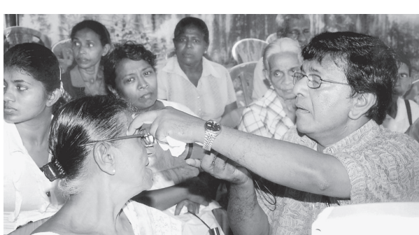
The Embuldeniya United Trade and Businessmen's Association conducted its annual eye camp for the sixth successive year at the Sampath Bank premises, Embuldeniya. Here an optician examines a patient. Around 320 persons received free spectacles.