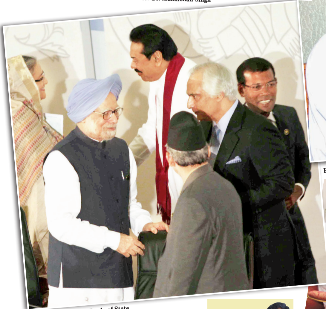
The President meet Heads of State