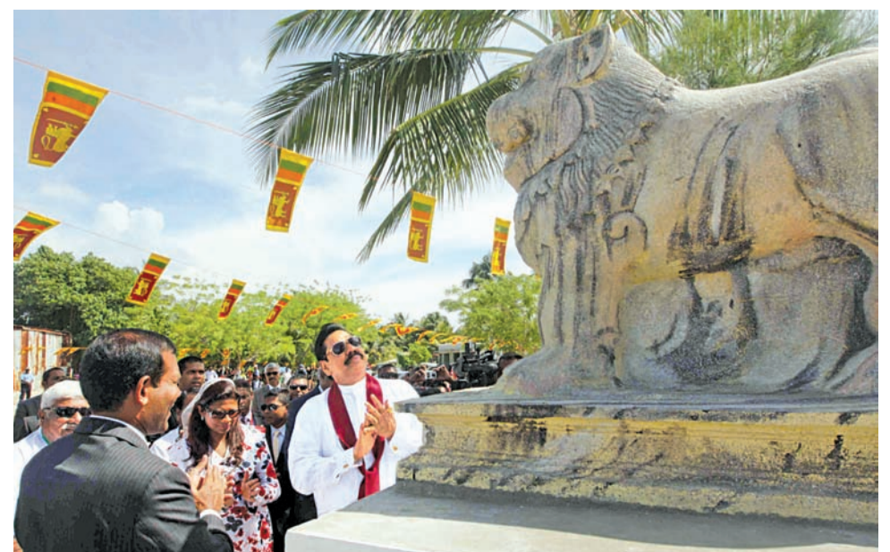
The President admires a monument