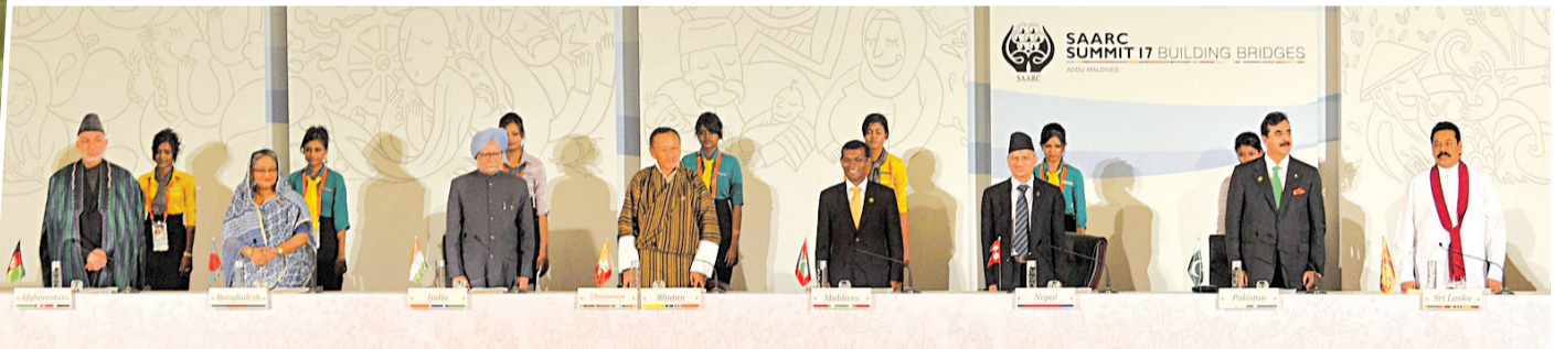
Heads of State at the opening of the 17th SAARC Summit