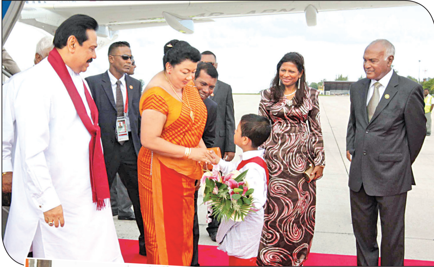
President Mahinda Rajapaksa being welcomed at the Male Airport on arrival for the 17th SAARC Summit