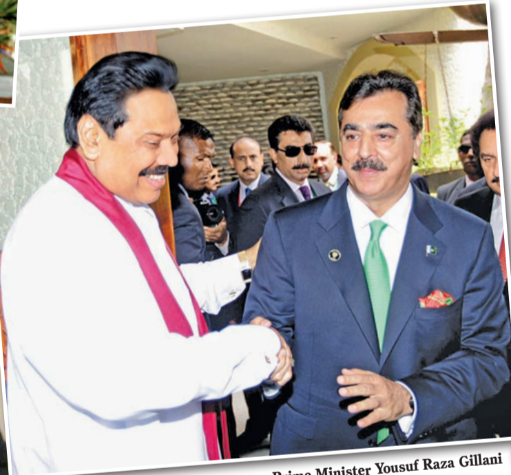
President Rajapaksa with Pakistan Prime Minister Yousuf Raza Gillani