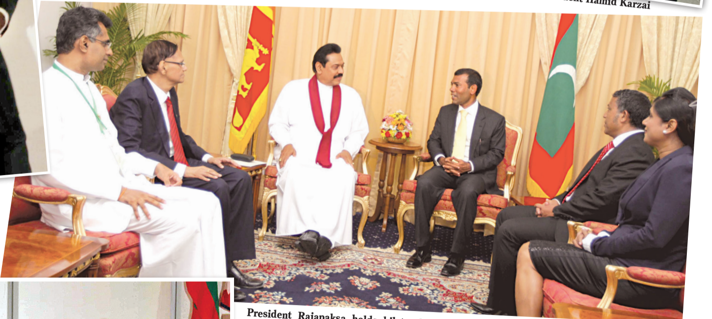
President Rajapaksa holds bilateral talks with his Maldivian counterpart Mohamed Nasheed