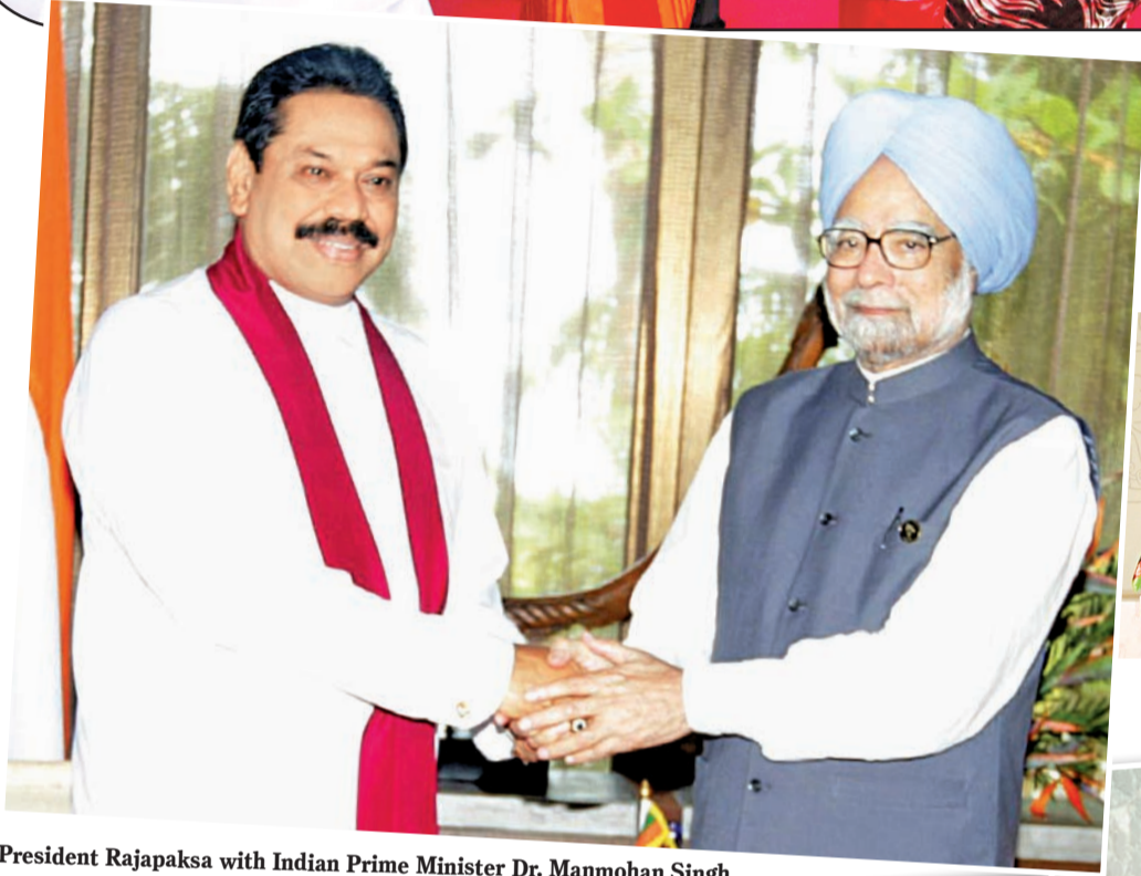
President Rajapaksa with Indian Prime Minister Dr. Manmohan Singh

The issues which call for our attention, particularly in the areas of social justice and climate change, require not further discussion but immediate action, said President Mahinda Rajapaksa in his address to the 17th SAARC Summit, in Addu City of the Maldives. "What is evident around us is a mood of urgency and even impatience," the President said.