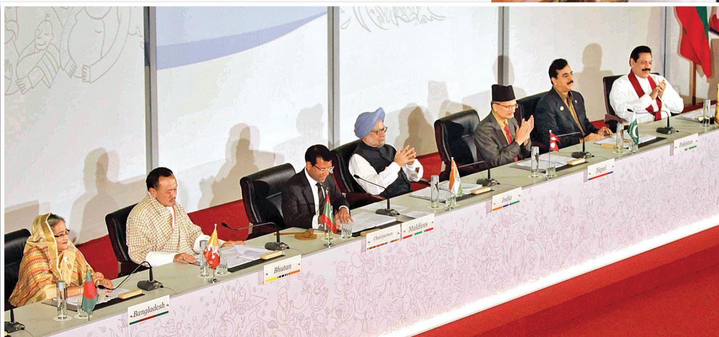
The closing ceremony of the 17th SAARC Summit was held in the Maldives on Friday with the participation of SAARC leaders. From left: Bangladeshi Prime Minister Sheikh Hasina, Bhutanese Prime Minister Jigme Y Thinley, Maldives President Mohamed Nasheed, Indian Prime Minister Manmohan Singh, Nepalese Prime Minister Baburam Bhattarai, Pakistani Prime Minister Yusuf Raza Gilani and President Mahinda Rajapaksa.