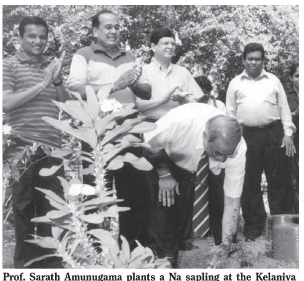
University compound at Dalugama, Kelaniya, in connection with the National Tree Planting Program, 'Deyata Sevana 2011'. The Deans of various Faculties also participated.