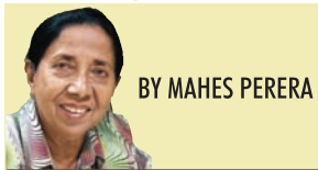
BY MAHES PERERA

Next week we will be carrying all the details of the meeting of the contestants with the judges yesterday, and the outcome of the display of their creations showcased by the models.