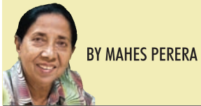
BY MAHES PERERA

Design communication, image presentation and individuality were some of the qualities that came into play when contestants presented themselves with their outfits to the panel of judges on December 3 to be selected for the next judging date, which will be January 8.