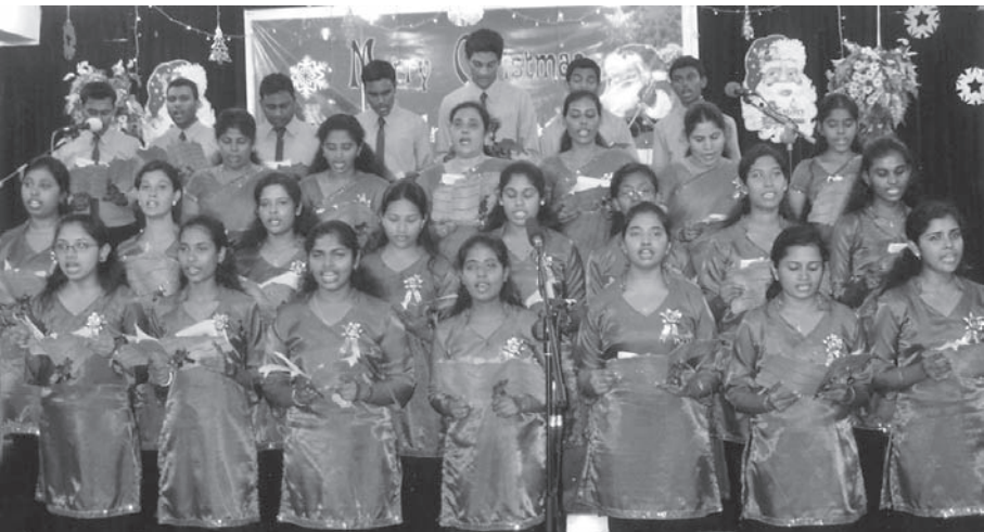
The Christmas carol service, organised by the Sri Lanka Mispah Prayer Missionary Ministry, Modera, Colombo 15 was held at its premises recently. Here, one of the events in progress.