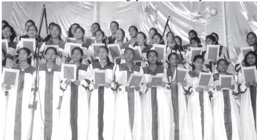
Ave Maria Convent, Negombo held its annual Christmas carols in the open stage of the school premises. Here the students render carols.