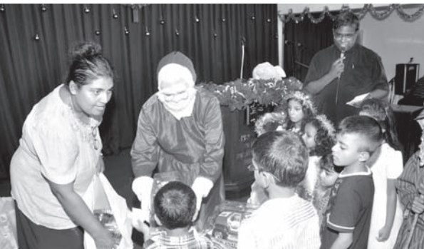
The annual Christmas program of the Assembly of God, Nawinna, for Sunday Schoolchildren was held in Nawinna recently.