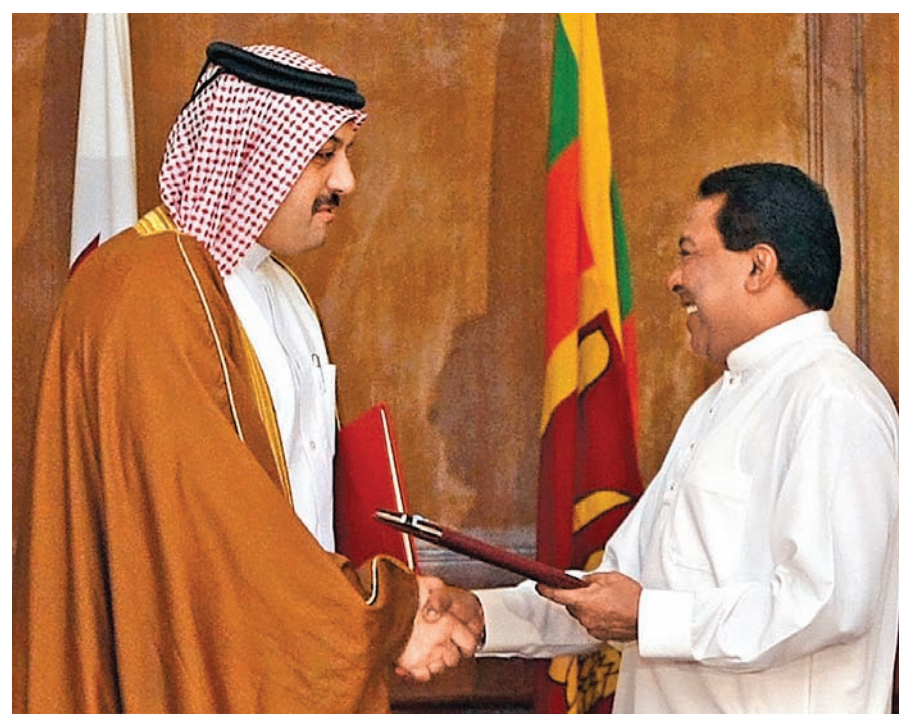
Meeting Higher Education Minister S. B. Dissanayake