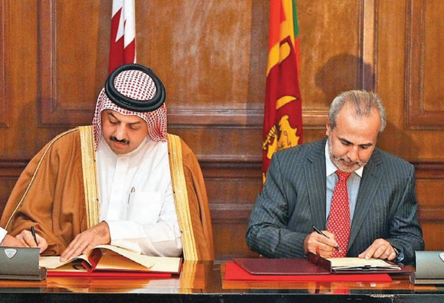
Justice Minister Rauff Hakeem signing an agreement