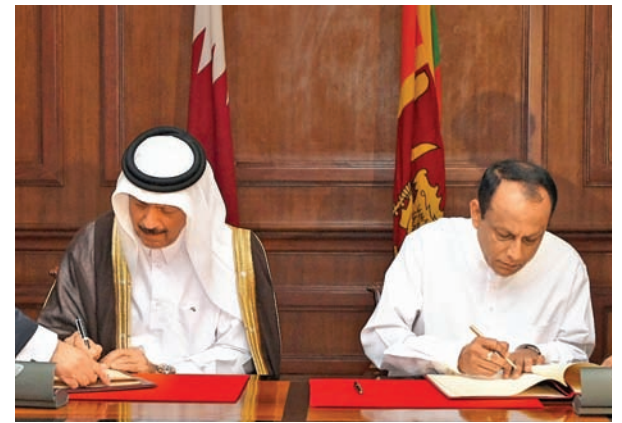
With Media Minister Lakshman Yapa Abeyawardena