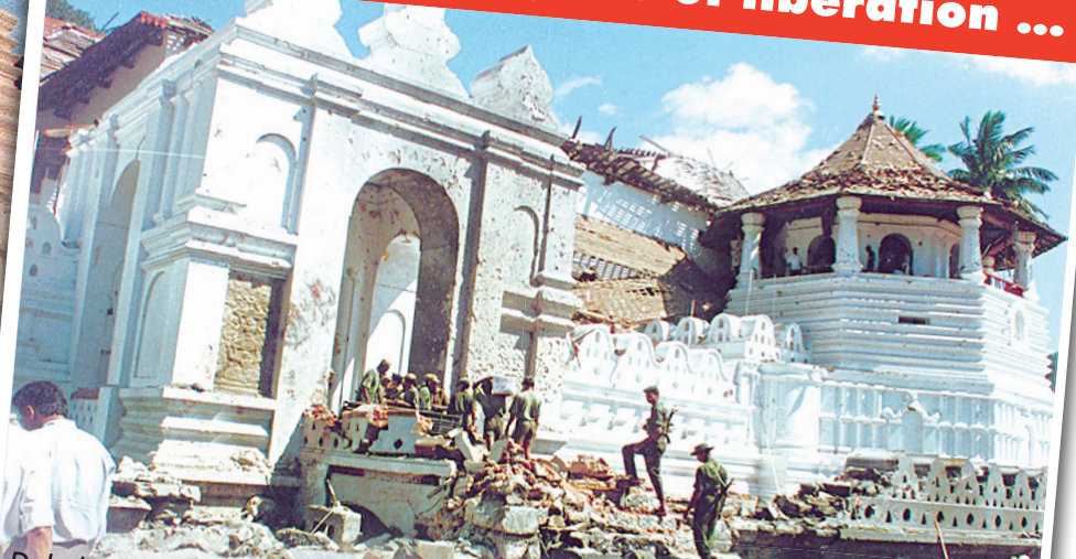
Dalada Maligawa bomb attack

■ The world's most ruthless terrorist outfit – the LTTE, had been instrumental in hundreds of terror attacks, massive bomb explosions targeting innocent civilians and brutal killings for almost three decades until they were crushed militarily in May, 2009.