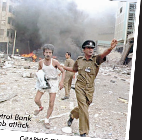
Central Bank bomb attack