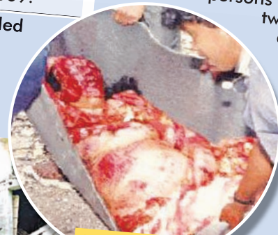
Body of an pregnant woman killed in the Central Bank terror attack

■ On January 25, 1998, the LTTE launched a dastardly attack on the most Sacred Temple of the Tooth in the city of Kandy. The Tiger suicide cadres exploded a massive truck bomb at the entrance of the Sri Dalada Maligawa, killing 16 persons including a two-year old and injuring over 25 others, all innocent devotees who were on their way to offer alms at the Temple on that fateful morning.