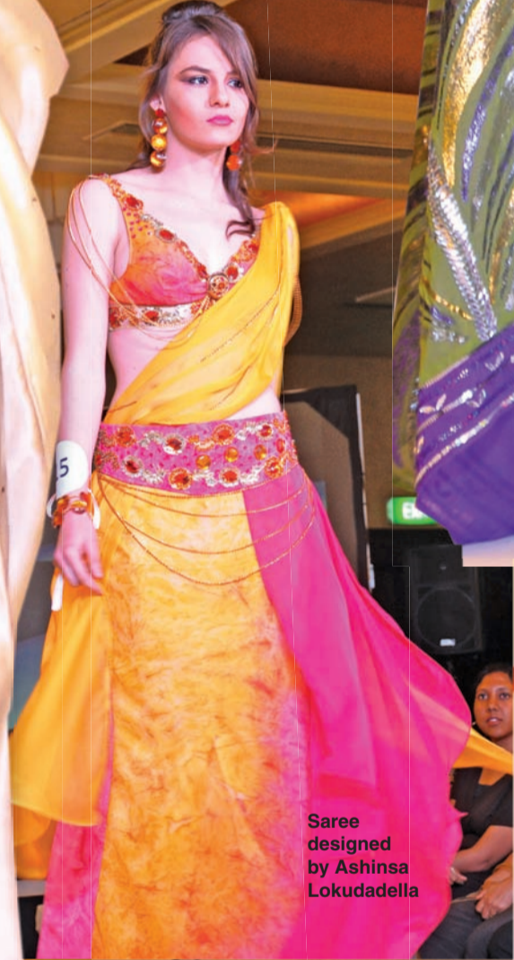
Saree designed by Ashinsa Lokudadella