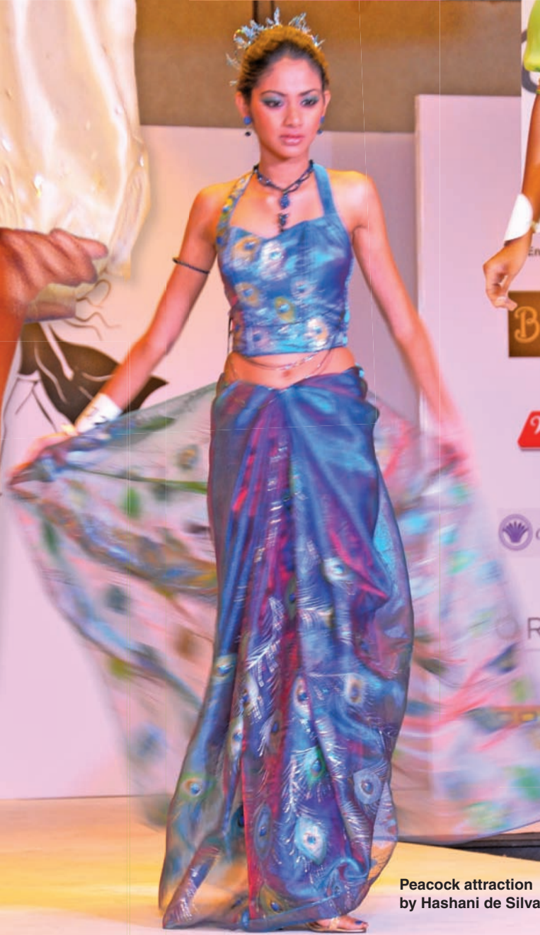
Peacock attraction by Hashani de Silva