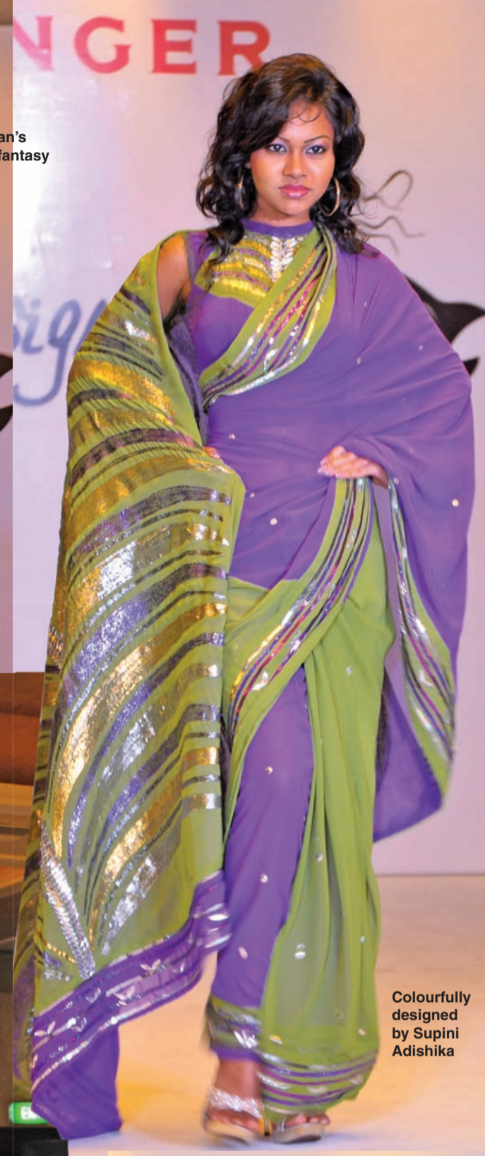
Colourfully designed by Supini Adishika