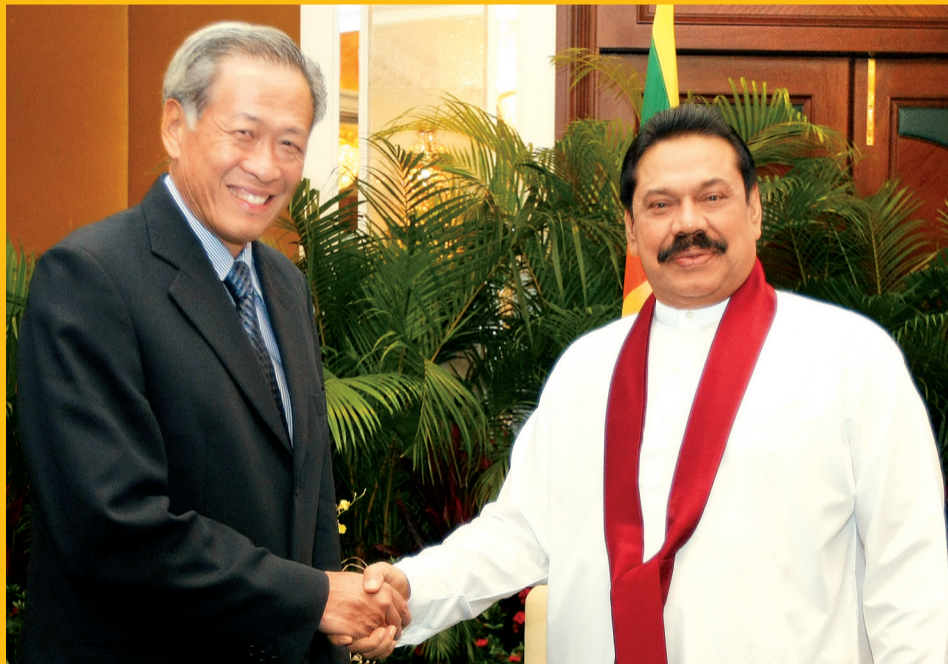
Meeting Defence Minister Dr. Eng Hen