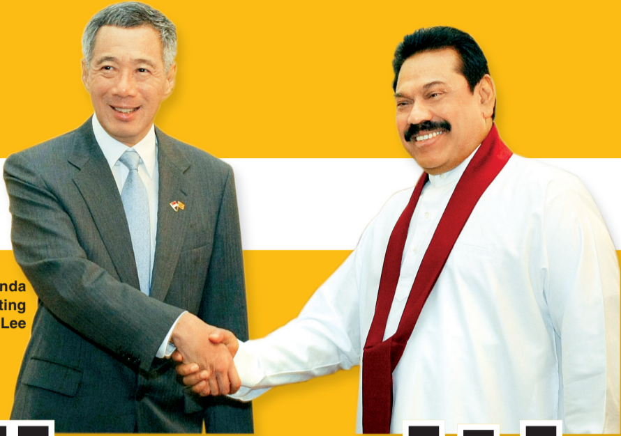
President Mahinda Rajapaksa meeting Prime Minister Lee Hsien Loong