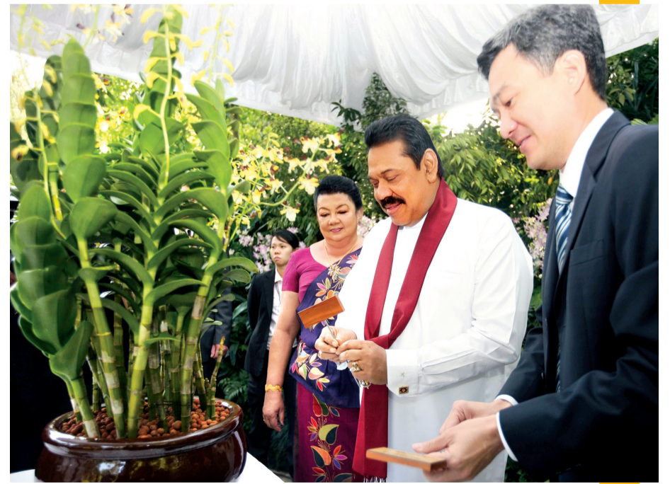
A new species of orchid being named Dendrobium Mahinda Shiranthi to mark President Rajapaksa's visit