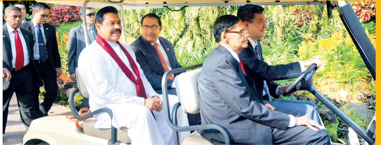
President Mahinda Rajapaksa arrives at the Singapore Botanical Garden