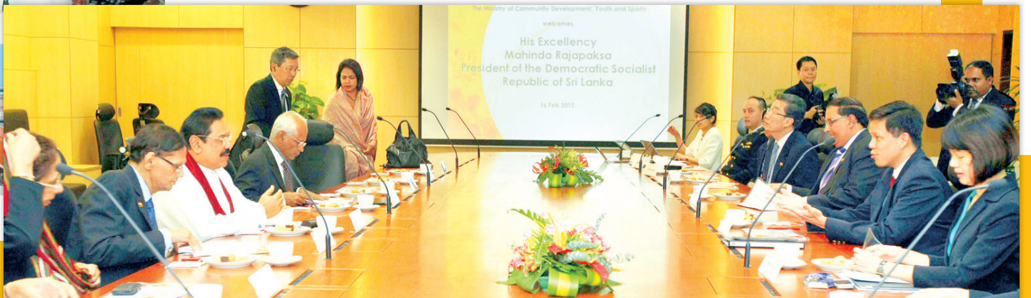
Meeting the youth of Singapore