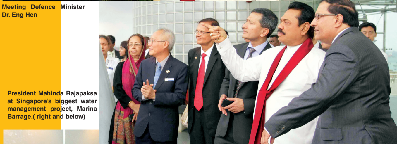
President Mahinda Rajapaksa at Singapore's biggest water management project, Marina Barrage. (right and below)