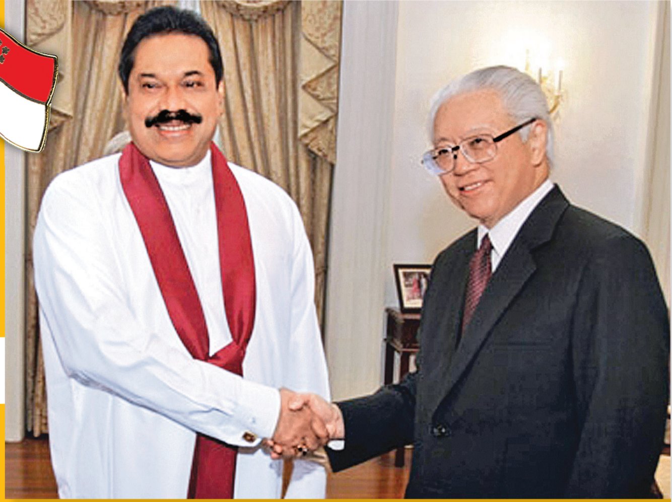
President Mahinda Rajapaksa being greeted by Singapore President Tony Tan Keng Yam