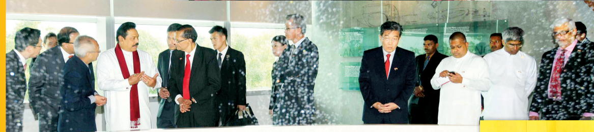
Pix: President's Media Unit