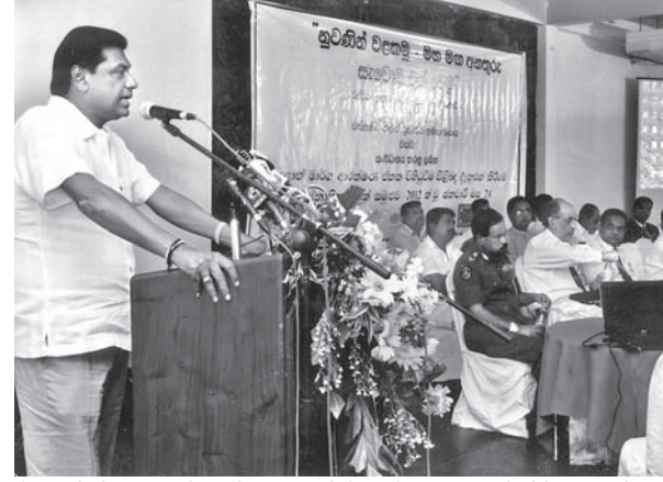
A workshop on 'Avoiding Road Accidents' was held recently at the Army Holiday Resort, Wadduwa. Here Minister of Transport Kumara Welgama addresses the gathering. Senior Minister P. Dayaratne also participated.