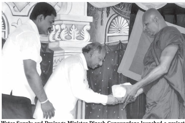
Water Supply and Drainage Minister Dinesh Gunawardane launched a project