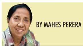
BY MAHES PERERA

A competition of a different kind unfolded at Thotupola, Piliyandala when the 12 contestants in the Derana Veet Miss Sri Lanka were put through their paces to participate in two special workshops to test their skills.