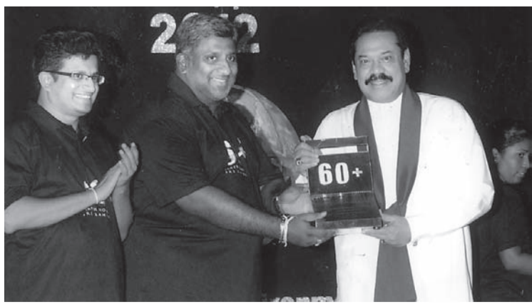
The 'Earth Hour 2012' was held in Kandy recently, under the patronage of President Mahinda Rajapaksa. Here WPC Chief Minister Prasanna Ranatunga, presents the Earth Hour 2012 memento to the President. Environment Minister, Udaya Gammanpila looks on.