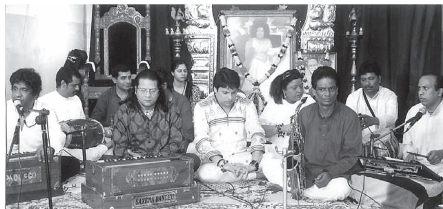
A special Bajana program was held by the Sri Sathya Sai Baba Centre, Colombo at the "Sai Shrine", New Chetty Street, Kotahena, Colombo 13 recently. The event was organised to mark its 45th anniversary. Here an item is being presented by a popular North Indian musical group.