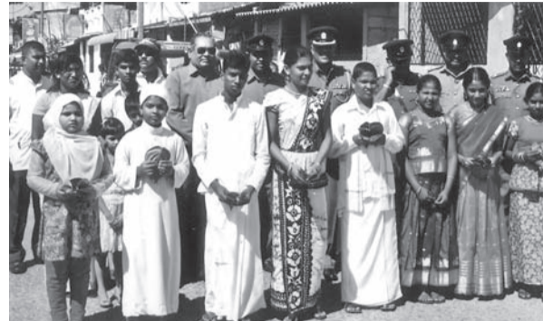
The New Year Festival organised by the Mattakkuliya police and the Eksath Tharuna Kela organisation was held at the Gemunupura playground, Mattakkuliya recently. Here the pupils of the pre-school Aliwatta, dressed in Sinhala, Tamil and Muslim attire with the police officers.