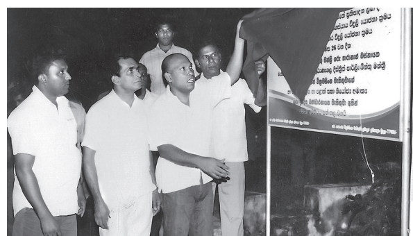
The rural electrification project of Siyambalanda under the 'Jathika Saviya - Gama Neguma Development Program' in Panduwasnuwara, Kurunegala was recently vested with the people by Indika Bandaranayake, Deputy Minister of Provincial Councils and Local Government, the chief SLPF organiser for Panduwasnuwara. It was constructed at a cost of Rs. 2.5 million for the benefit of 125 low-income families. Here the Deputy Minister unveils the nameboard of the project at the ceremony.