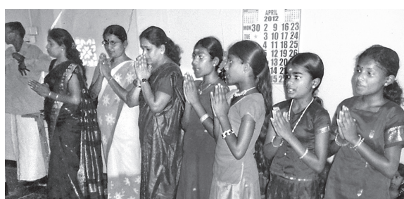
The Hindu Association, Nawalapitiya conducted the 'Thirunavakarasu Nayanar Guru pooja' at the Sri Muthumariamman Kovil, Upper Division of Imboopitiya Estate recently. Here a group of children sing the welcome song.