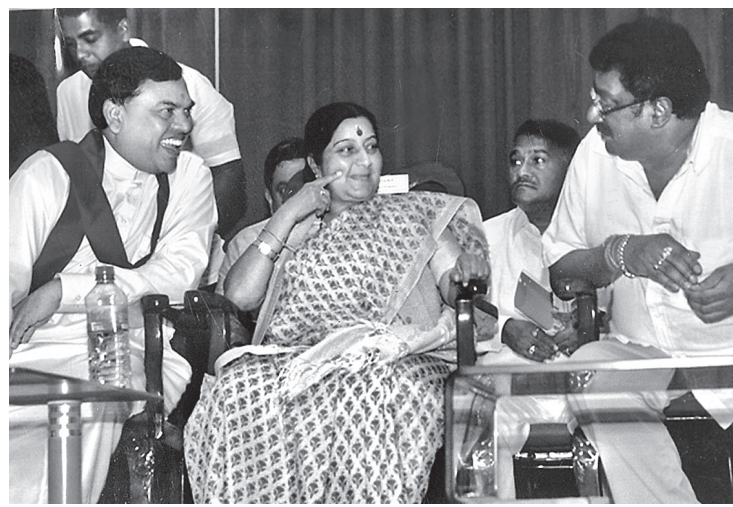
A meeting was held at the D.K.W. Hall, Hatton to felicitate the Opposition leader of the Indian Parliament Mrs. Sushma Swaraj and the Indian Parliamentary delegation under the patronage of Minister Arumugam Thondaman. Economic Development Minister Basil Rajapaksa presided.