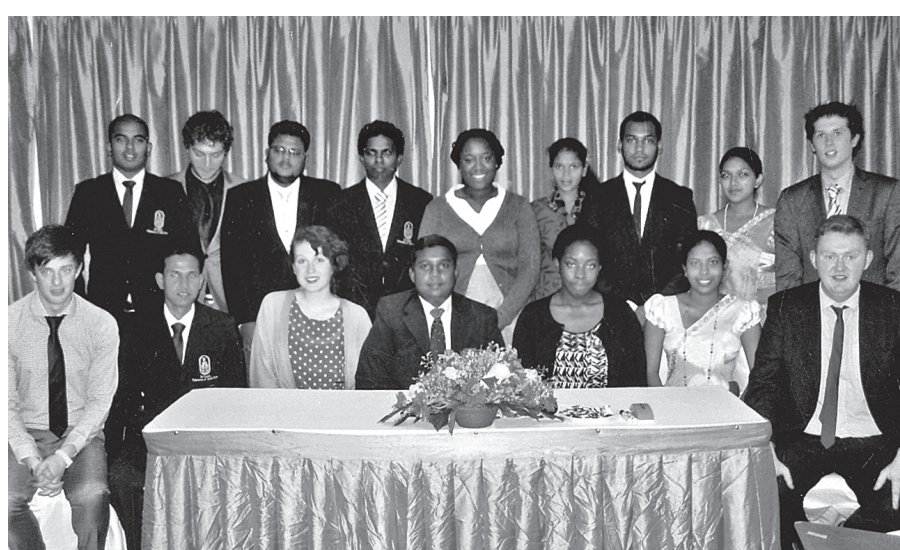
The inauguration ceremony of the Commonwealth Young Leaders Exchange Program between Sri Lanka and the United Kingdom was held at the 'Global Towers', Bambalapitiya recently, jointly organised by the Youth Affairs and Skills Development Ministry and the National Youth Services Council. Here the two teams with the officials.