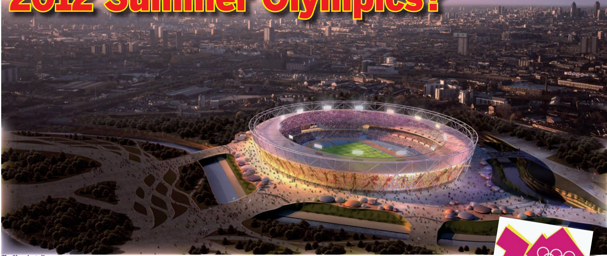
The Olympic stadium