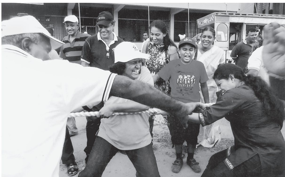
The Sinhala Hindu New Year Sports Meet of the National Water Supply and Drainage Board was held at the Moratuwa Tyrone Fernando Stadium recently. Here the tug-of-war event is in progress.