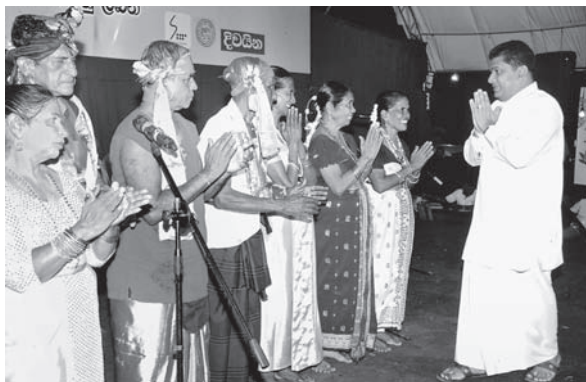
The Kadawatha Vesak Zone organised by the Lasantha Alagiyawanna Foundation, on the initiative of Economic Development Minister Basil Rajapaksa was held at Kadawatha recently. Here Deputy Construction, Engineering Services, Housing and Common Amenities Minister Lasantha Alagiyawanna congratulates the members of the Mahara Elders' Society who staged a Vesak drama.