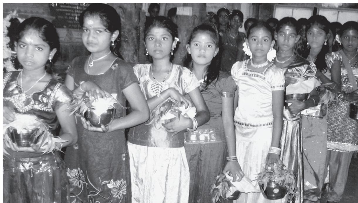
The holy milk pot procession ( Palkudam Bawani ) of Arulmigu Sri Pathrakali Amman Kovil, Orugodawatta, Wellampitiya took place recently. Here the devotees wend their way in a procession from Poopala Selva Vinayagar Moorthy Kovil, Peliyagoda to the Amman Kovil.