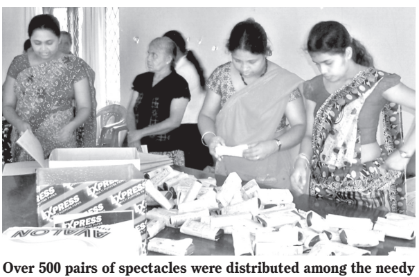
in Matuwagala and Ellawala in the Eheliyagoda D S division by the Ministry of Social Welfare, Sabaragamuwa PC was held distribution.