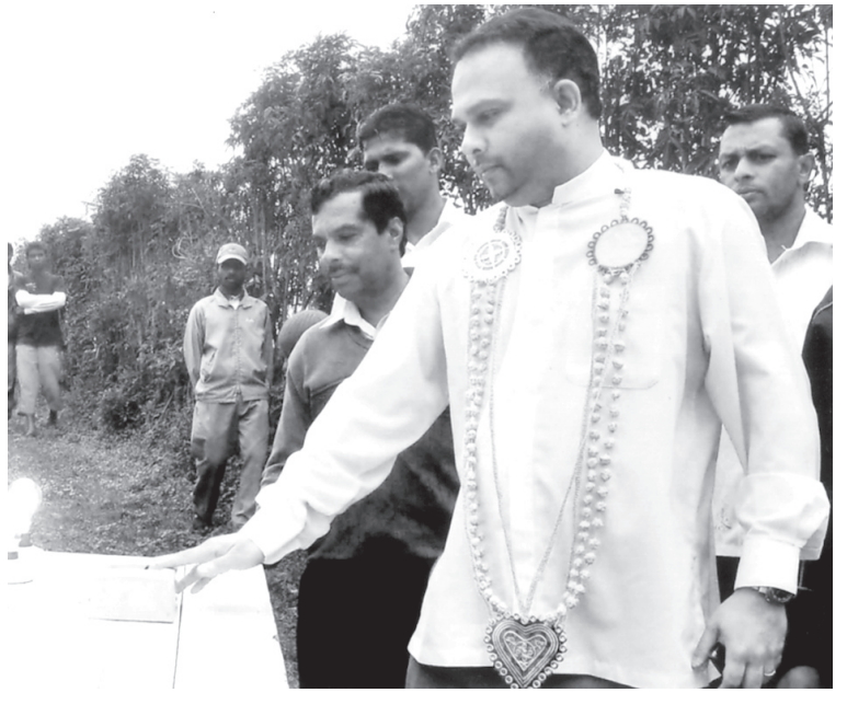
Minister of Public Management Reforms and Nuwara Eliya district MP Navin Dissanayake commissions the electricity scheme at Dimutugama, Magoda, Meepilimana in the Nuwara Eliya district under the Gama Naguma project at a cost