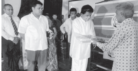
The flag, song and a logo designed for the Rural Development Department of the North Central Provincial Council (NCP) were presented to the Governor Karunaratna Divulgane by Cooperatives, Food and Trade and Rural Development Minister H.B. Semasinghe at the Anuradhapura Cooperative auditorium recently. Anuradhapura district Parliamentarian Sehan Semasinghe looks on. Dushyanta Kumara, Minister H.B. Semasinghe and R.D.O. Ananda Kalawala designed the logo, flag and the song.