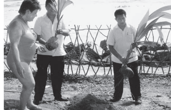
The Siddhalepa Group of Companies organised a photograph competition and an exhibition among its staff in the company premises under the theme 'Green Economy and You', to mark World Environment Day. The Siddhalepa Ayurveda Health Resort in Wadduwa planted coconut and herbal saplings with the participation of foreign guests to highlight the importance of conserving the environment.