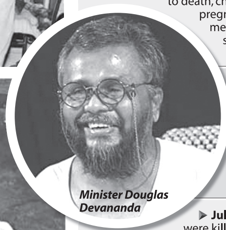
Minister Douglas Devananda

▶ July 2, 1997: Over 100 LTTE terrorists wielding sharp weapons, clubs and firearms stormed Irakkandy Muslim village in Trincomalee and butchered 34 civilians. In their usual orgy of violence, the terrorists clubbed and tortured children and infants to death, chopped women including pregnant mothers, and hacked men and women until they suffered a slow painful death.