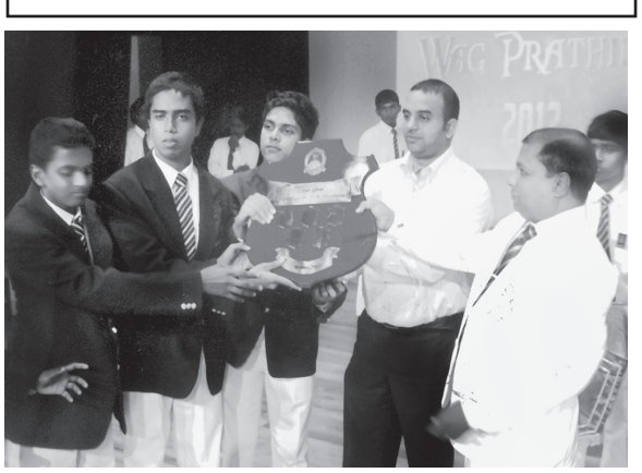
The debating competition, Wag Prathibha organised by Isipathana College's Isiwara debating team and the Old Boys of '97 Group, to mark the College's 60th anniversary was held recently at the Sambuddha Jayanthi Hall, Colombo. The finals between D.S. Senanayake College, Colombo and Sri Sumangala College, Panadura saw the latter emerge champs. Here the captain of the team with

The meeting will be followed by an annual dinner at Weligampitiya, Ja-ela.