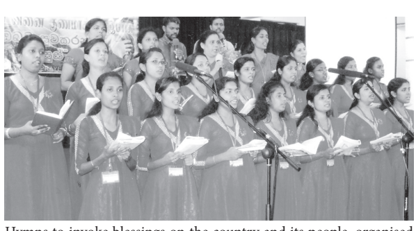
Hymns to invoke blessings on the country and its people, organised by the Sri Lanka, Mispah Prayer Missionery Ministry, Modera, Colombo 15 was held at its premises recently. Here one of the events in progress.