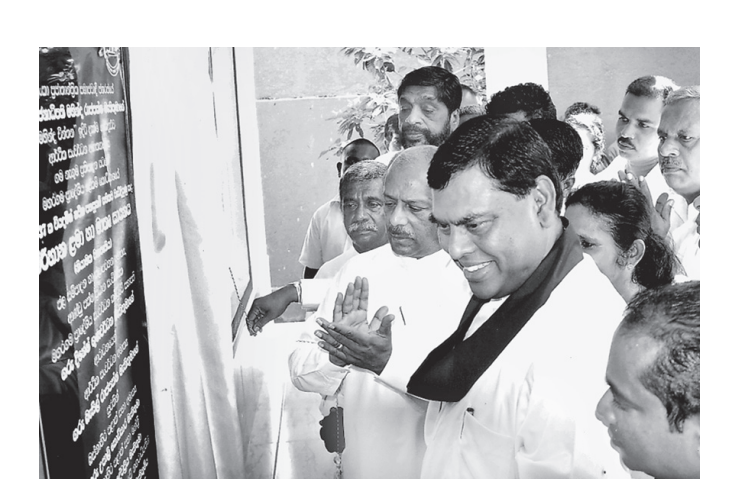
A children's and maternity health clinic built under Gama Naguma at a cost of Rs. 3.7m. was opened by Economic Development Minister Basil Rajapaksa recently at the invitation of Water Supply and Drainage Minister Dinesh Gunawardana.