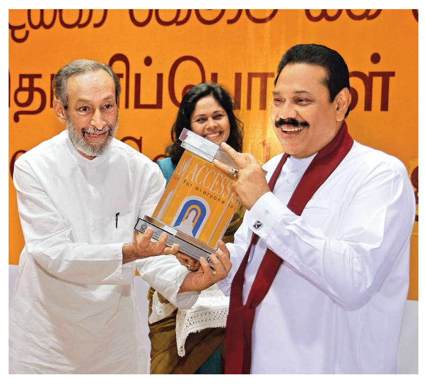
National Languages and Social Integration Minister Vasudeva Nanayakkara presents the Social Integration Policy Framework, theme and logo to President Rajapaksa