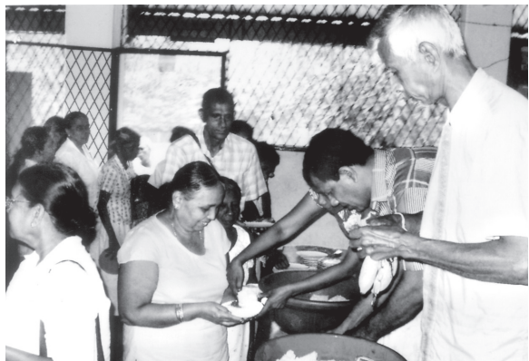
Breakfast was served free by the Ingiriya Elders' Society to the members of the Malpura Elders' Society, Angoda who passed through Maha Ingiriya town while on a pilgrimage. Here members of the Ingiriya Elders' Society serve food to a member of the Malpura Society.