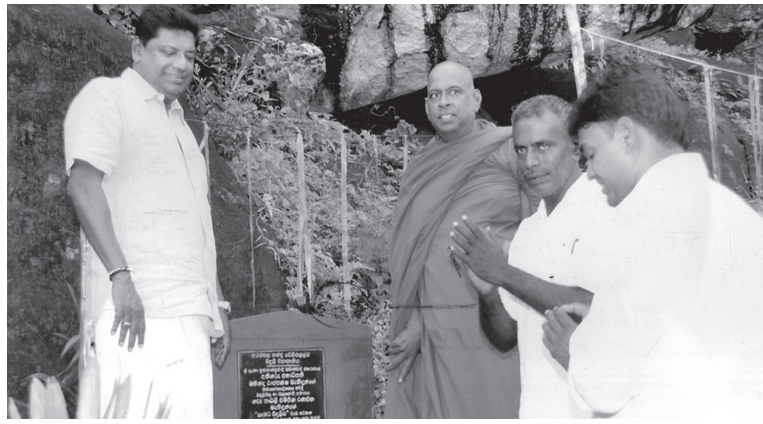
Transport Minister Kumara Welgama opened the rural electricity scheme at Pahanwatta in Dodangoda, under the "Electricity for All" project of the Power and Energy Ministry recently. Western Provincial Councillor Ven. Thebuwana Piyananda Thera is also in the picture.