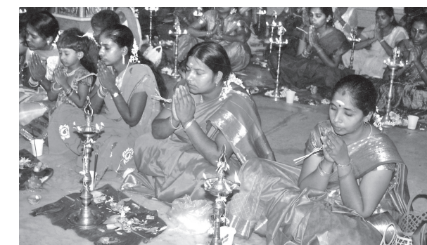
The Uaralakshmi Viratha Thiruvilakku pooja (lamp-lighting) festival was held at Hindu kovils and societies islandwide recently. Here a ceremony is being held at the Sri Venkateswarer Maha Vishnu Kovil, Modera, Colombo 15.