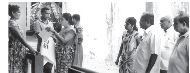
A public awareness program, organised by the Waste Management Authority, Western Province with the assistance of the Horana Pradeshiya Sabha was held in Moragahena recently. Here they explain the program to a house owner.