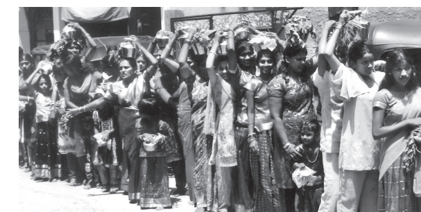
The Pal Kudam Bawani (Holy Milk Procession) to invoke blessings on the country and the people was held at Arulmigu Sri Bathrakali Amman Kovil, Wadulawatta, Wellampitiya recently. Here women devotees carry milk pots in a procession.

A recorded public talk on "How is one to have complete order?" delivered by the late Indian sage J. Krishnamurti will be replayed at study Centre, Beddagana, Duwa Road, Kotte today at 10.30 a.m. It is organised by the Krishnamurti Centre, Sri Lanka Inc.