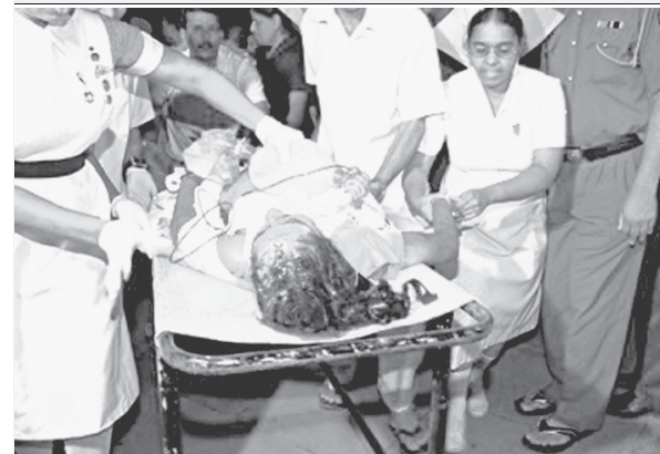
GRAPHIC BY MAHIL WIJESINGHE

▶ We salute Sri Lanka's Security Forces for providing a safer today for all communities to live in peace and harmony.