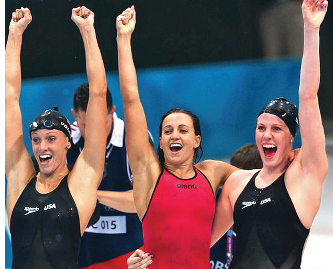
Women's 4x100-Metre Medley Relay- The USA had the fourth-fastest qualifying time of 3:58.88 without their best racers. In the final, everything once again came together and the Americans hold world record with a time of 3:52.05.