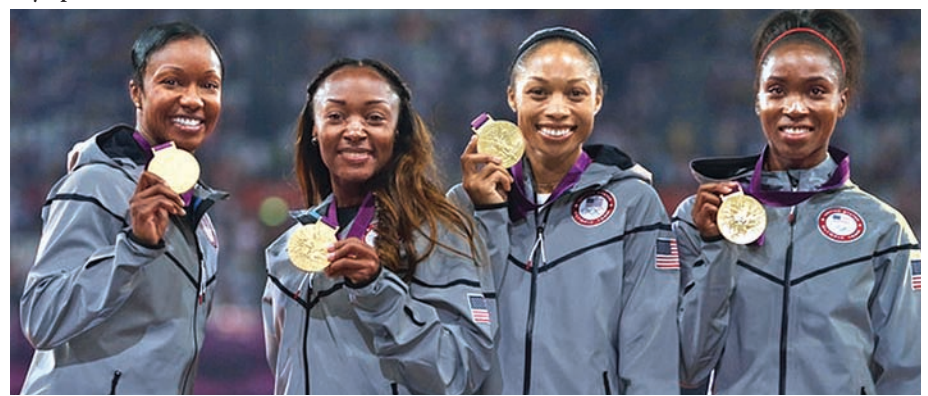
Women's 4x100-metre relay - The world record of 41.37 seconds had survived since 1985. Team USA smashed the record in 40.82 seconds to win gold.