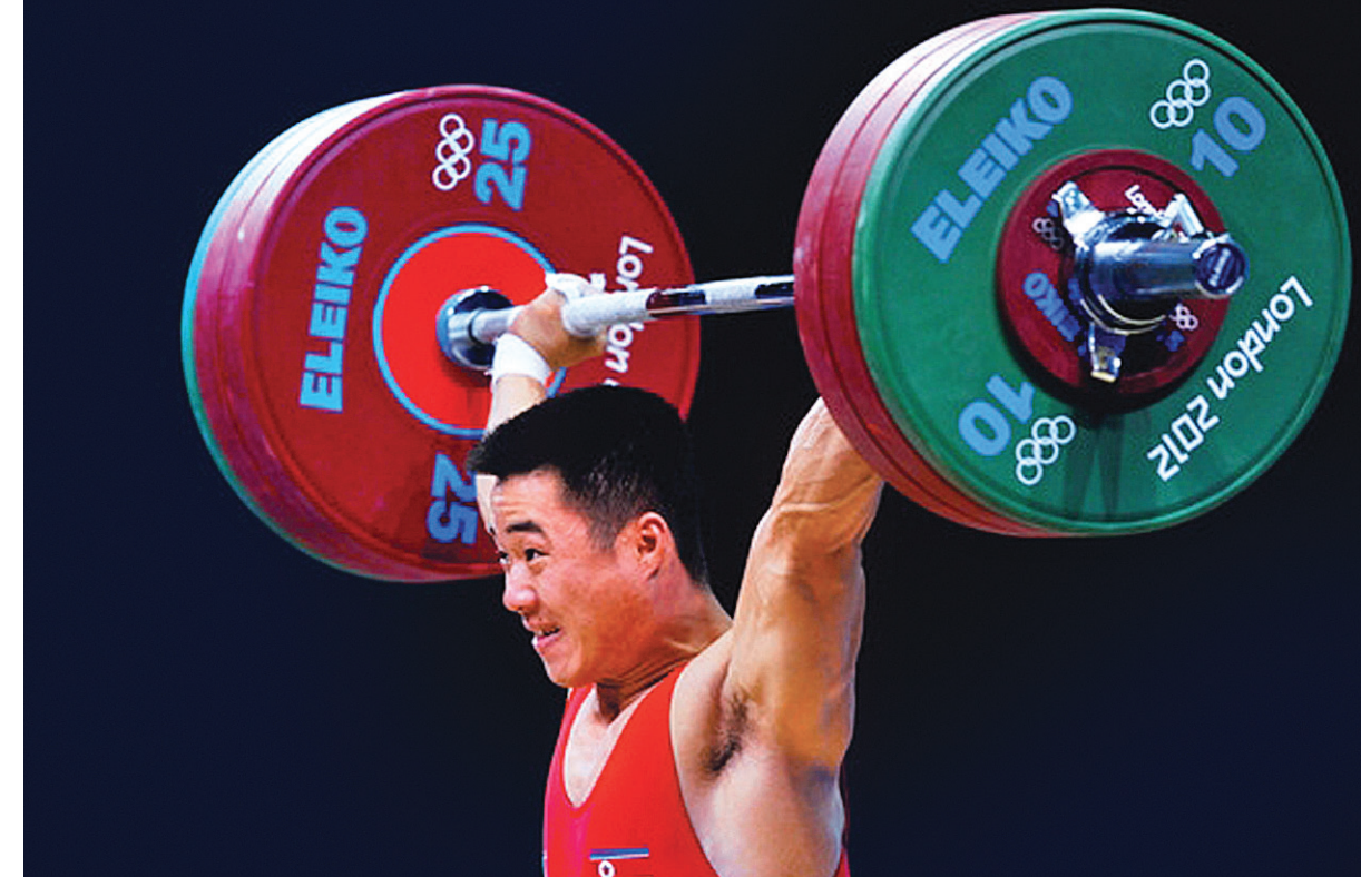
62\;Kilograms, Combined\;\;One\;of\;the\;most\;consistent\;performances\;in\;weight lifting,\;North\;Korea's\;Kim\;Un\;Guk\;added\;the\;world\;record to his repertoire after setting the snatch Olympic record for his first lift. Kilograms/lbs: 327 kilos (721 pounds).