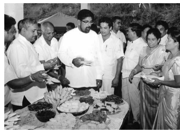
Mass Media and Information Minister Keheliya Rambukwella laid the foundation stone for an ayurvedic dispensary at Kundsale recently. Here the Minister enjoys some refreshments in the company of Provincial Councillors and Pradeshiya Sabha members of the area.