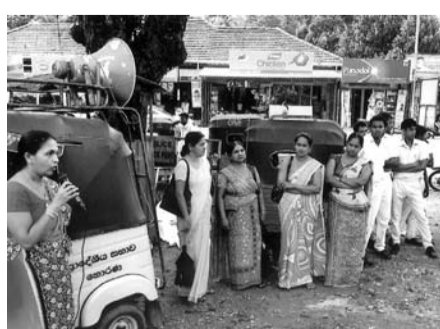
A public awareness program organised by the Waste Management Authority of the Western province, with assistance of the Horana Pradeshiya Sabha was held in the Moragahena town recently. Here the officers explain the importance of systematic waste management to the townfolk.