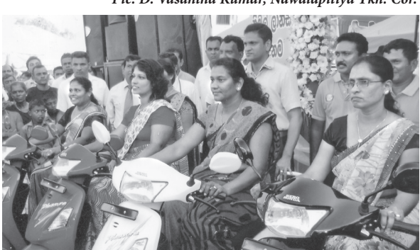
Four women from the low income group received motor-cycles at a presentation ceremony at the Negombo Municipal Council Grounds.W.A. Nimal Lanza, Minister of Tourism and Fisheries of the Western Province and Anthony Jayaweera, Mayor of Negombo are also in the picture