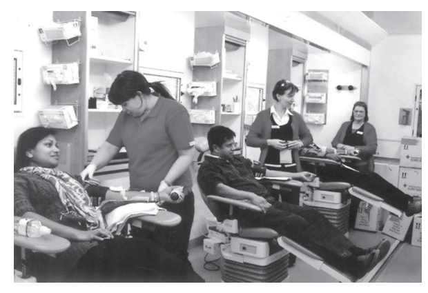
A blooddonation campaign was organised by Sri Lankan students of the Dhamma and Sinhala School at Kambah in Canberra ACT recently, with the assistance of Australia-SL Buddhist Association. Here pupils donate blood at the Australian Red Cross Unit,