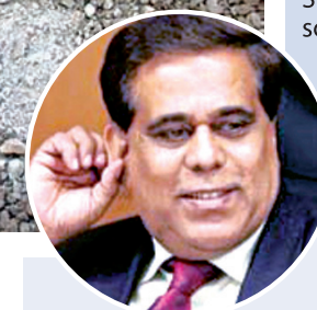
Minister Nimal Sripala de Silva

■ Sept 13, 2006: Over thirteen civilians were injured when an LTTE terrorist lobbed a hand grenade into a poultry stall in Poonhottam, Vavuniya. The terrorist had arrived on a push cycle, threw a hand grenade and fled the scene injuring 13 civilians,