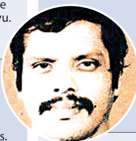
Mayor of Jaffna, Ponnuthurai Sivapalan,